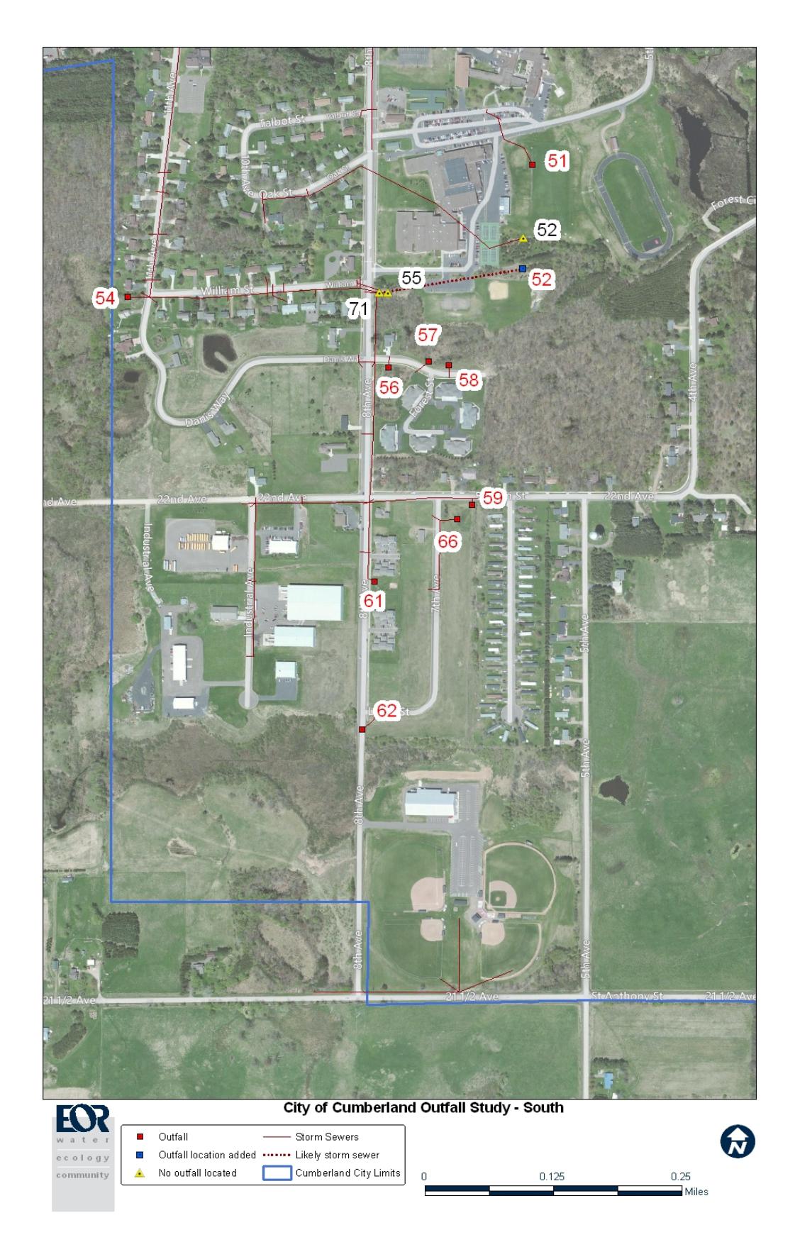
Figure 6. Outfall Locations, South.