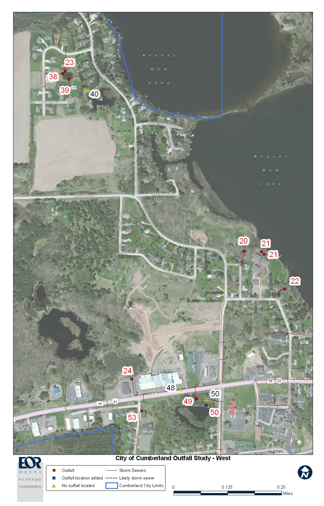
Figure 4. Outfall Locations, West.