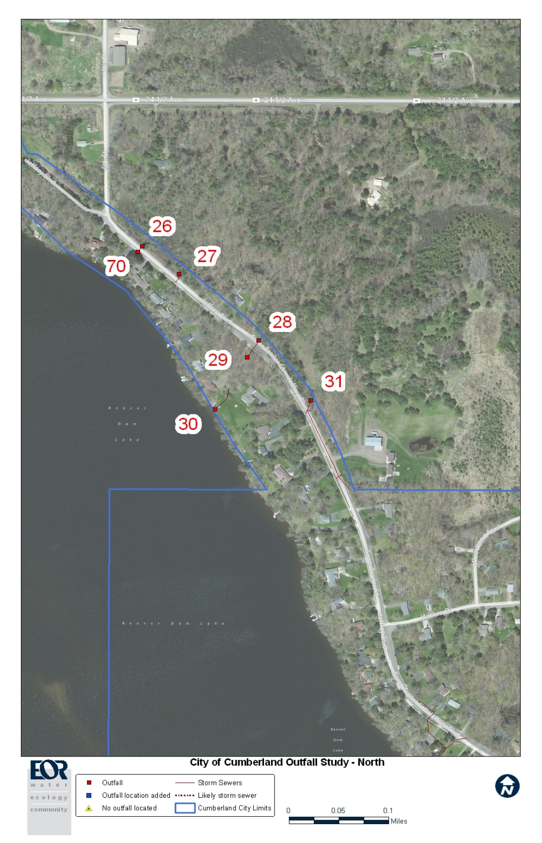
Figure 2. Outfall Locations, North.