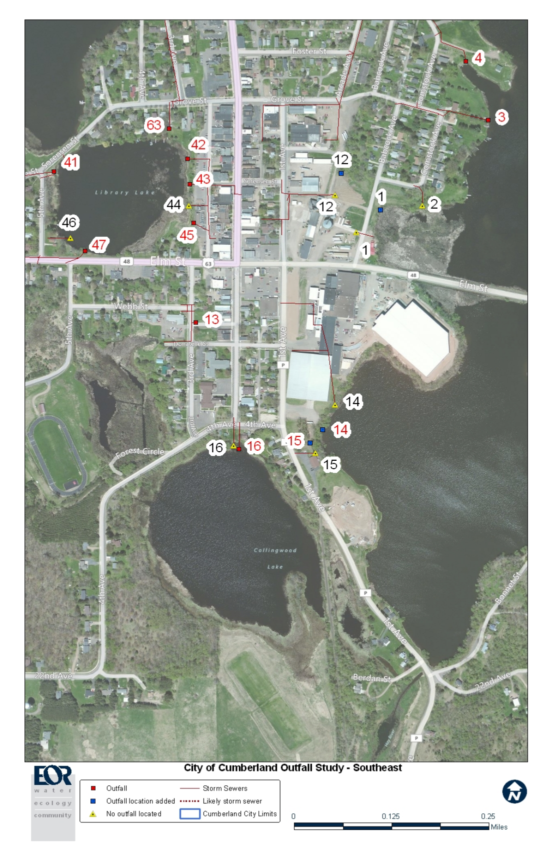
Figure 5. Outfall Locations, Southeast.