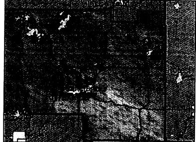
Approximate project area shown in red