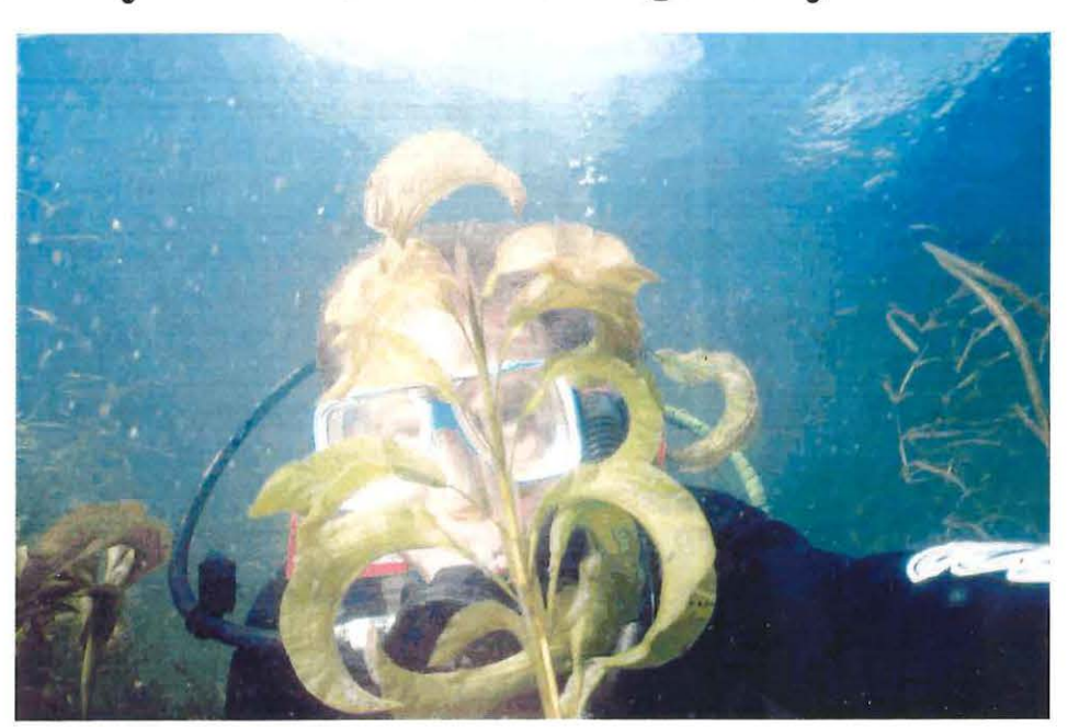
Here is a picture of largeleaf pondweed from Bear Lake. This is a desirable aquatic plant species. Bear Lake has relatively good aquatic plant diversity and should promote good water clarity.

In August of 2006, aquatic plant distribution was estimated to be at 611 acres. If this coverage can by maintained, the odds are good that clear water conditions will be sustained as well.