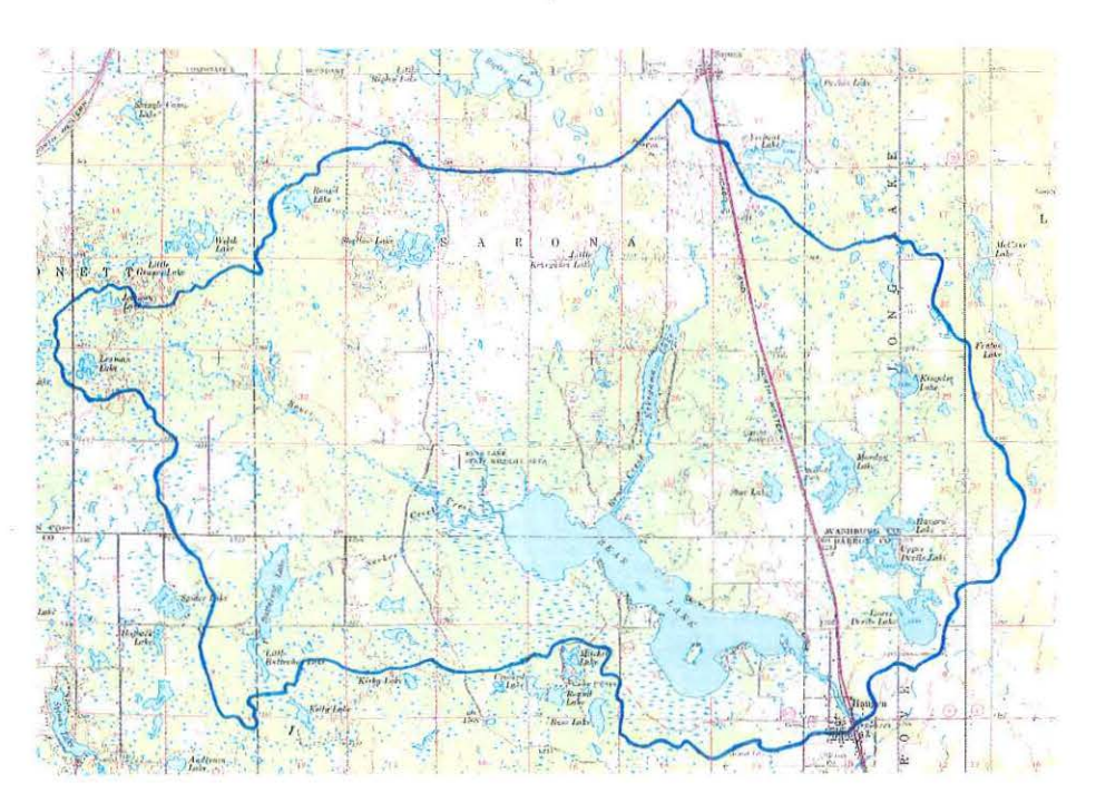
The watershed drainage area to Bear Lake is about 30,464 acres and is outlined in blue.

A watershed is the land area around the lake that captures rainfall and where all the drainage and runoff goes into the lake. It is also called a drainage basin. If the watershed has pollution sources, then the pollution will be carried into the lake with runoff. It is important to reduce the source of pollution in the watershed because this in turn will reduce the amount of pollution that gets into the lake.