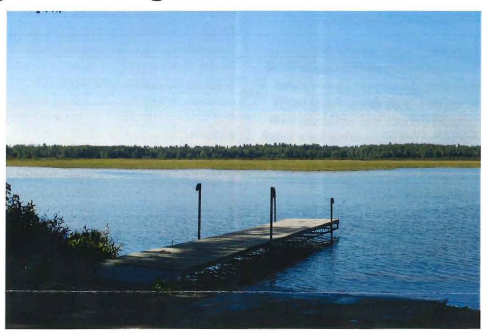
Bear Lake, Barron County, Wisconsin

good water clarity that is found in Bear Lake.