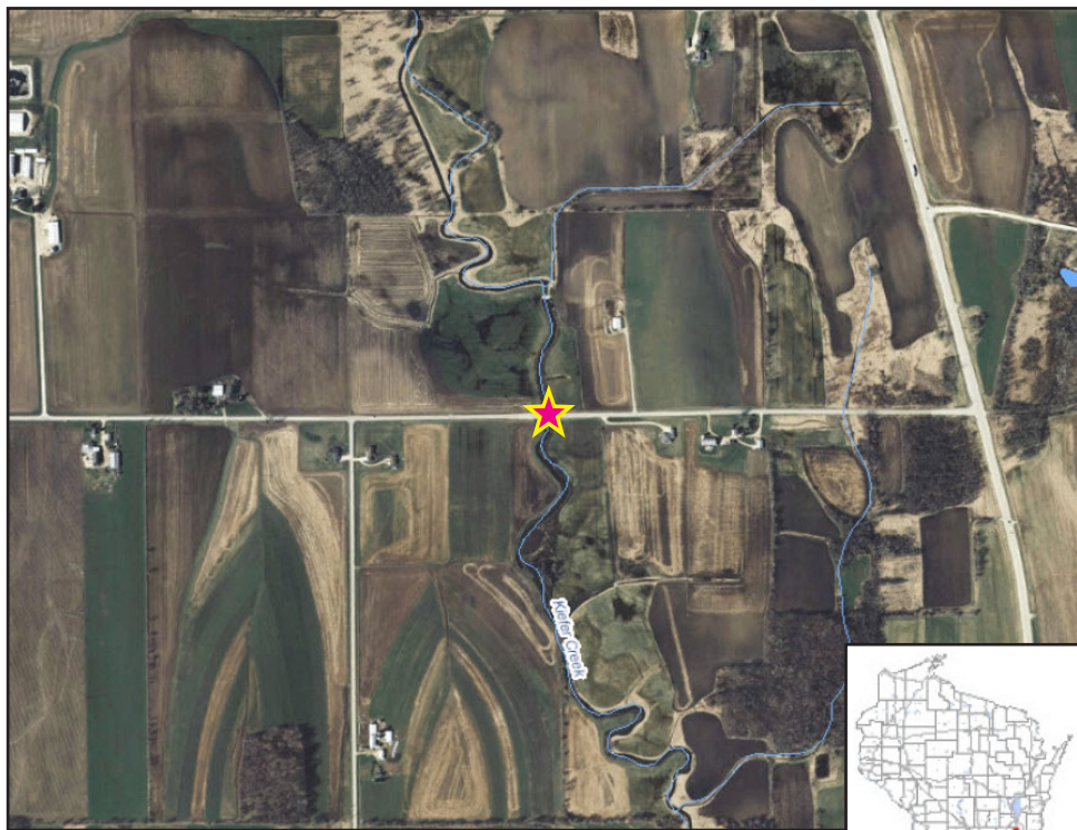
Map Legend ★ - Sampling Location for 2014