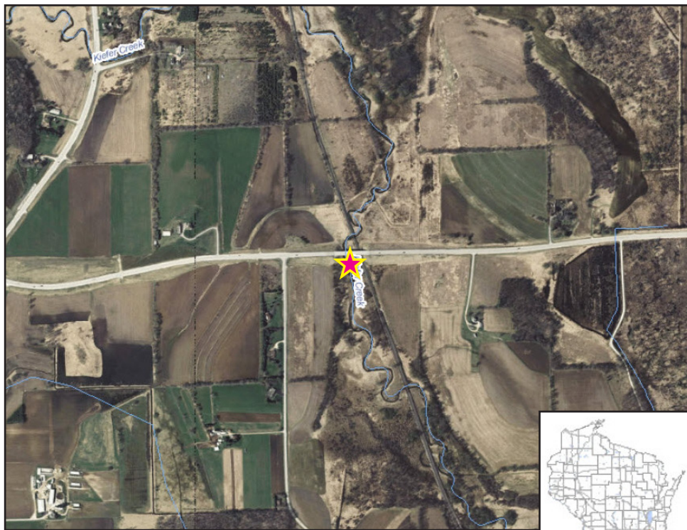
Map Legend ★ - Sampling Location for 2014