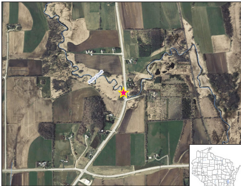
Map Legend ★ - Sampling Location for 2014