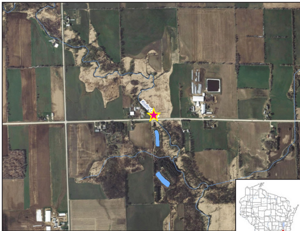
Map Legend ★ - Sampling Location for 2014