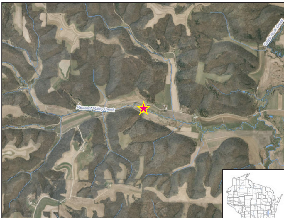
Map Legend ★ - Sampling Location for 2014