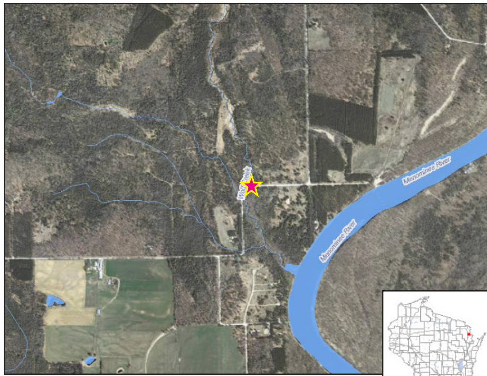
Map Legend ★ - Sampling Location for 2014