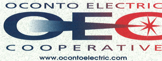
Exhibit III (a)