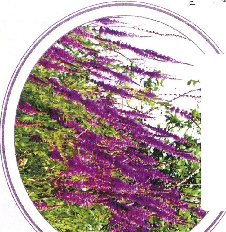
Exhibit III (b)

A MAJOR THREAT TO WISCONSIN'S WETLANDS AND WATERWAYS