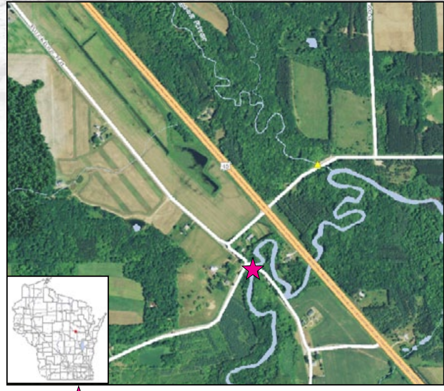
Map Legend - Sampling Location for 2015