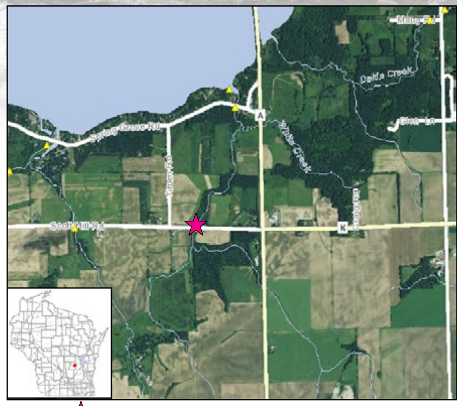
Map Legend 👉 - Sampling Location for 2015