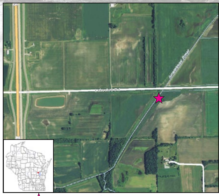
Map Legend - Sampling Location for 2015