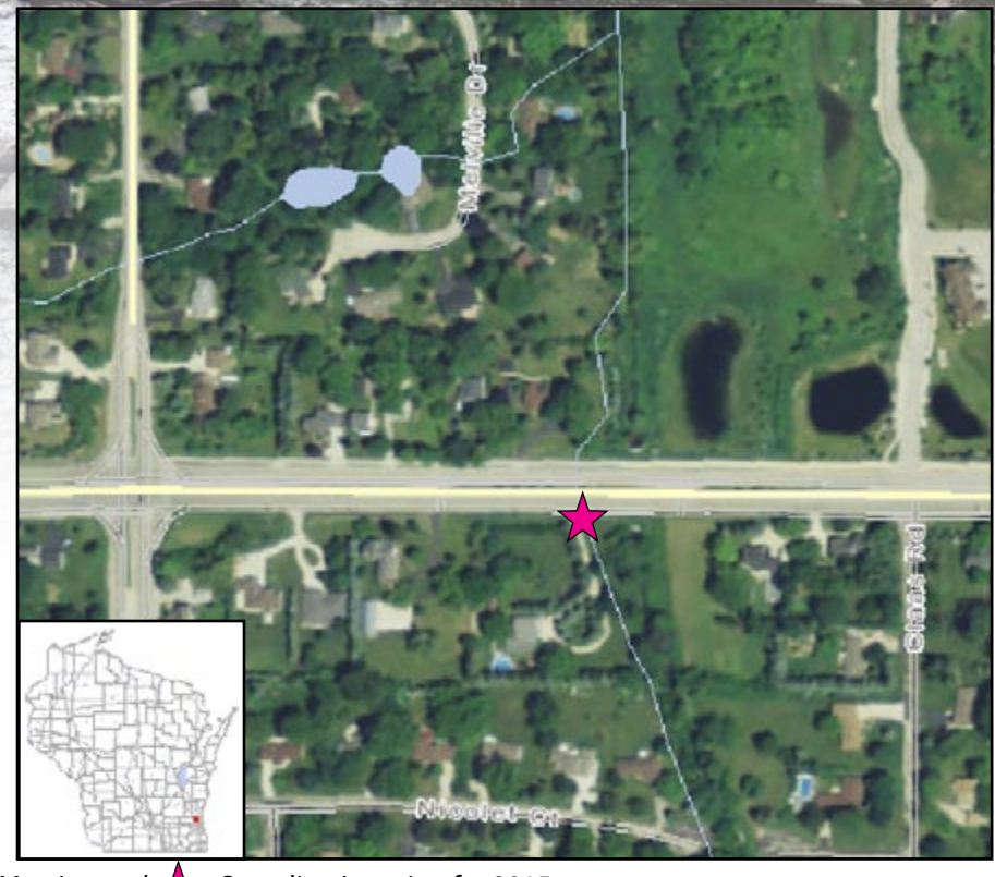
Map Legend 👉 - Sampling Location for 2015