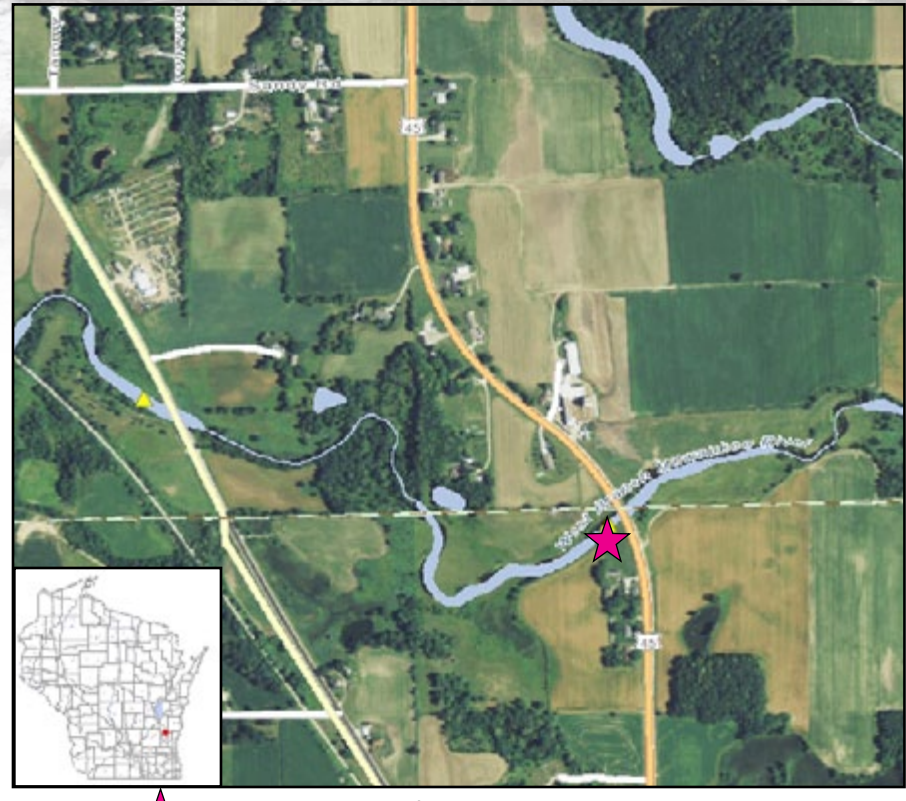
Map Legend — Sampling Location for 2015