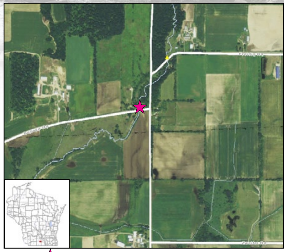
Map Legend - Sampling Location for 2015