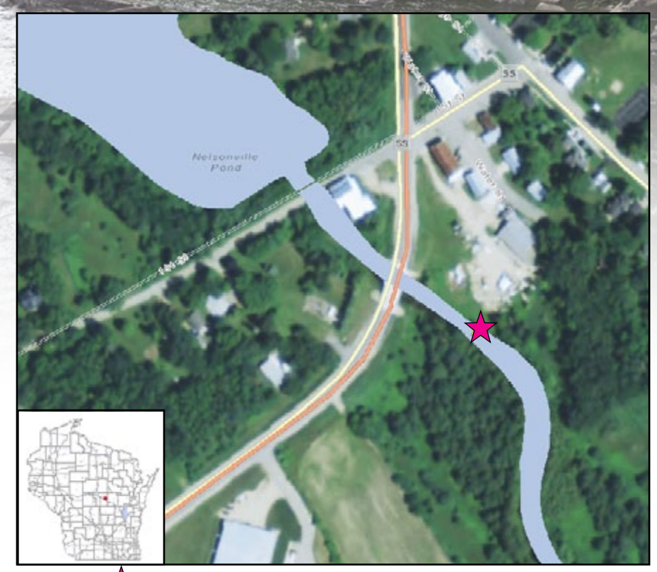
Map Legend — Sampling Location for 2015