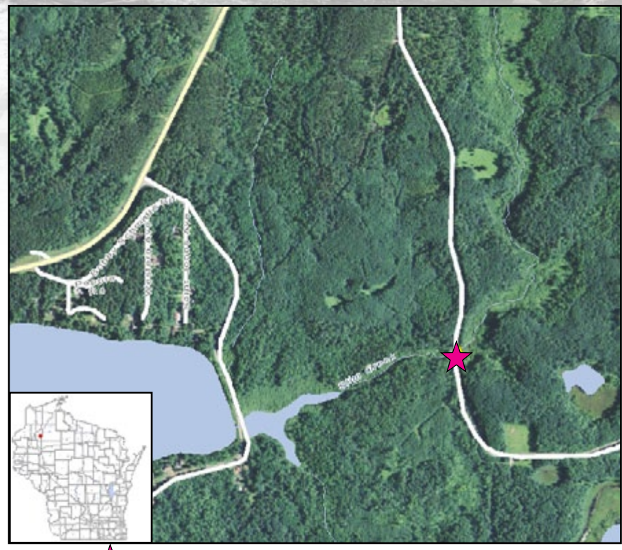
Map Legend - Sampling Location for 2015