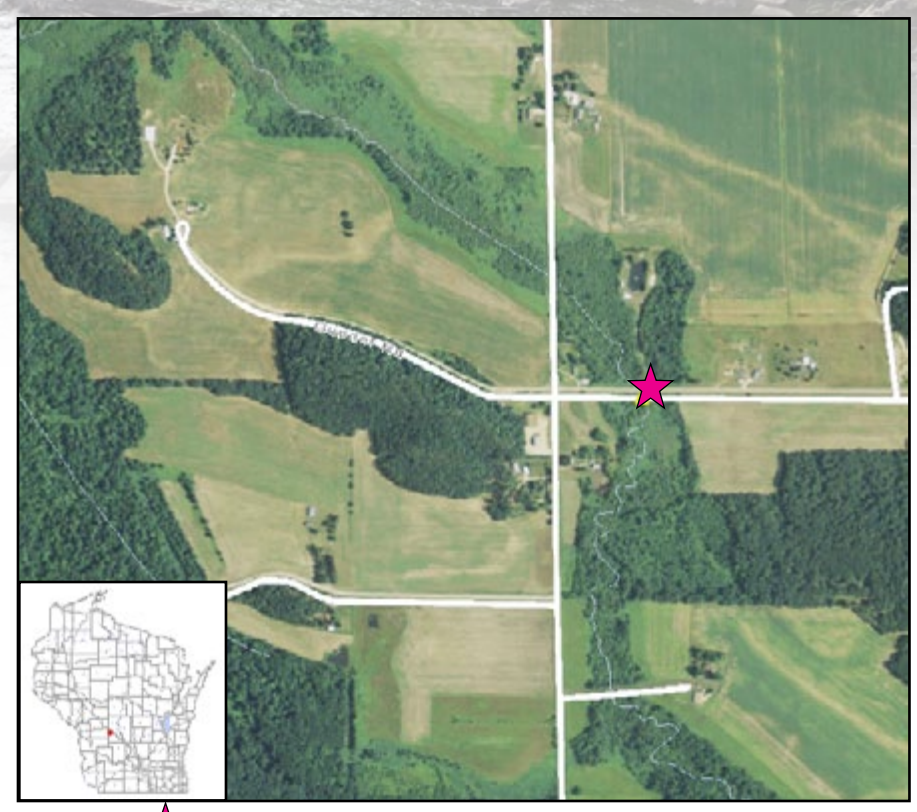
Map Legend - Sampling Location for 2015