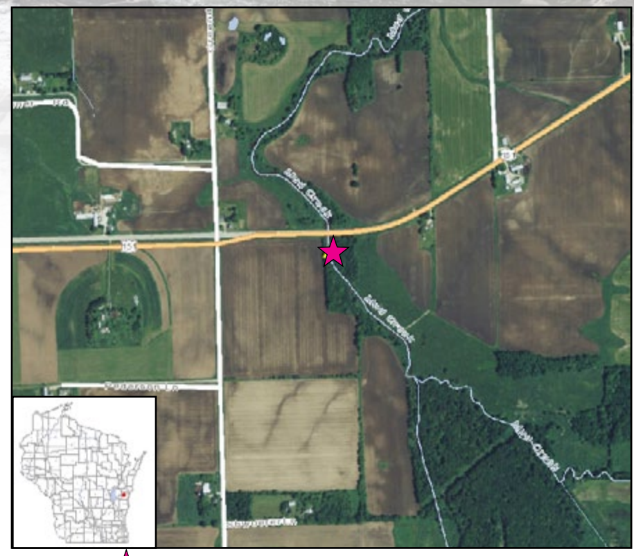
Map Legend — Sampling Location for 2015