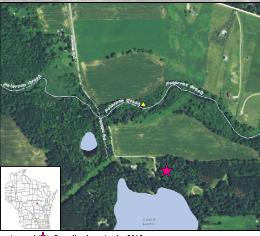
Map Legend 🔶 - Sampling Location for 2015