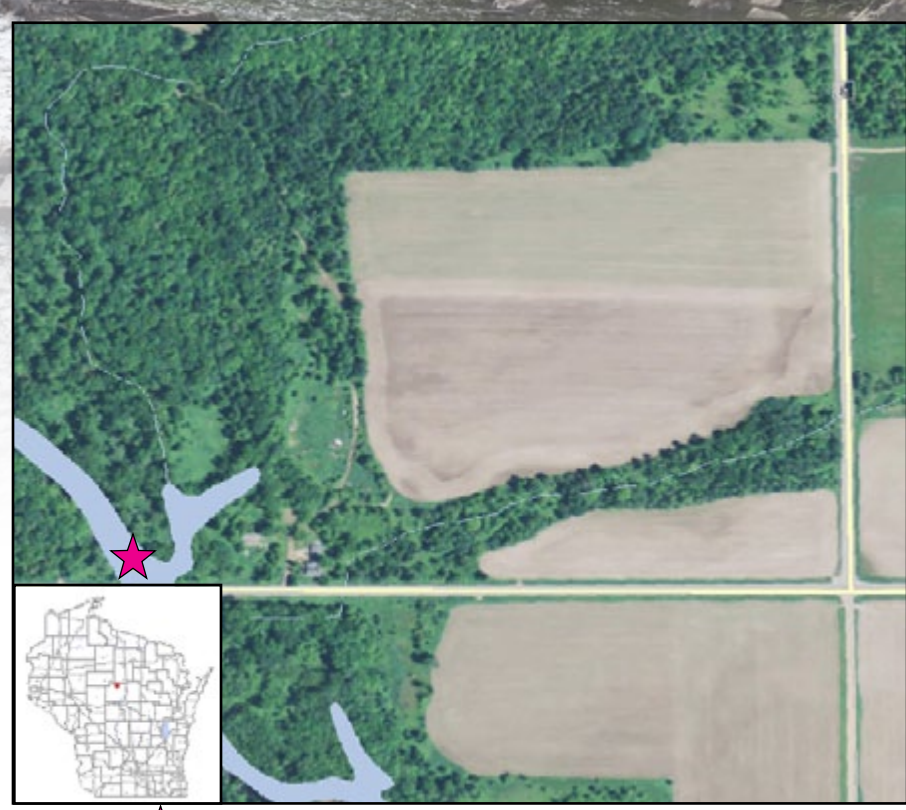
Map Legend - Sampling Location for 2015