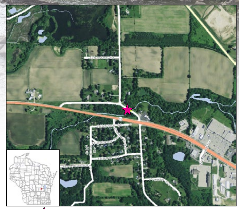
Map Legend 👉 - Sampling Location for 2015