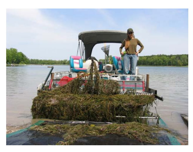
Figure 3. Divers ready to be towed behind the pontoon boat to scout and pull EWM.

The Friends of Lake Emily offered a bounty of $1.00/wet pound of Eurasian watermilfoil, and several divers accepted this incentive. The bounty was capped at $1500.00, all of which was paid out to divers. Gary Nilsen, Director of the Friends of Lake Emily, reported that the bounty was not as effective as they had hoped, because many of the stems were broken off due to poor hand-pulling practices, and the root systems re-sprouted.