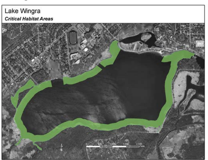
Figure 3. Proposed Lake Wingra Critical Habitat Areas

In error, the 2007 Lake Wingra plan's proposed sensitive area (now called critical habitat) map showed Vilas Lagoon as a proposed sensitive area. DNR did not designate any critical habitat areas in response to that plan. The proposed 2013 Lake Wingra plan update no longer shows Vilas Lagoon as a critical habitat area, acknowledging the fact that late season harvesting to facilitate ice skating, at the request of City of Madison Parks, has occurred for many years and this historic recreational use of the lagoon has been balanced with the need for native species protection. The Vilas Lagoon portion of the "Ponds" plan also notes this.