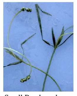
Small Pondweed

<u>Small pondweed (Potamogeton pusillus)</u> was the third most abundant vascular plant species occurring at 30.1% of the photic zone. It was present at 37.3% of the sites with vegetation and had a 11.6% relative frequency of occurrence.