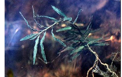
Fern Pondweed

Fern pondweed ( Potamogeton robbinsii ) is a submergent pondweed with robust stems and strongly two-ranked leaves, creating a feather or fern-like appearance while in the water. Fern pondweed sprouts in the spring and thrives in deeper water. Fern pondweed provides habitat for invertebrates that are grazed by waterfowl and also offers good cover for fish, particularly northern pike (Borman, et al., 1997).