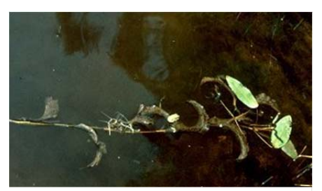
Large-leaf Pondweed

<u>Large-leaf pondweed (Potamogeton amplifolius)</u> was the second most abundant vascular plant species occurring at 29.9% of the photic zone. It was present at 37.6% of the sites with vegetation and had an 18.6% relative frequency of occurrence.