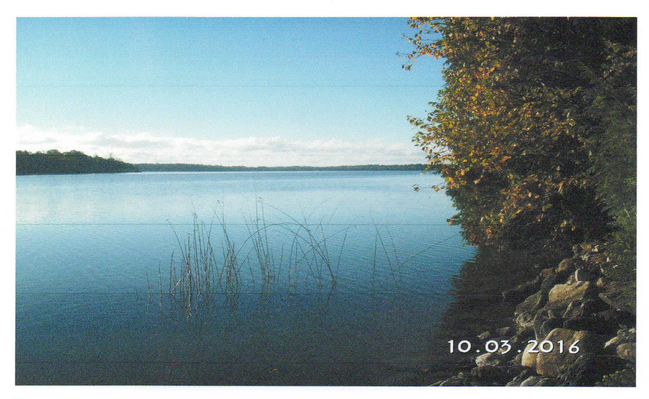
Figure 9. Production of numerous stems on rhizome during 2016 at Mahlberg.