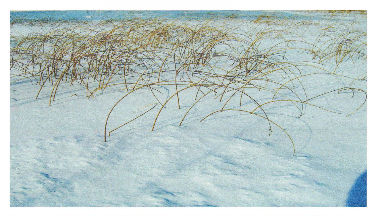
Figure 12. Arching character of bulrush develops on both vegetative and floral stems during late summer.