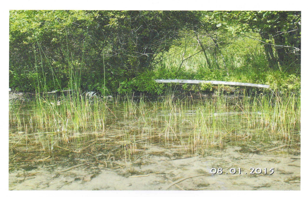
Figure 11. Bulrush population at south end showing signs of having been foraged by geese.