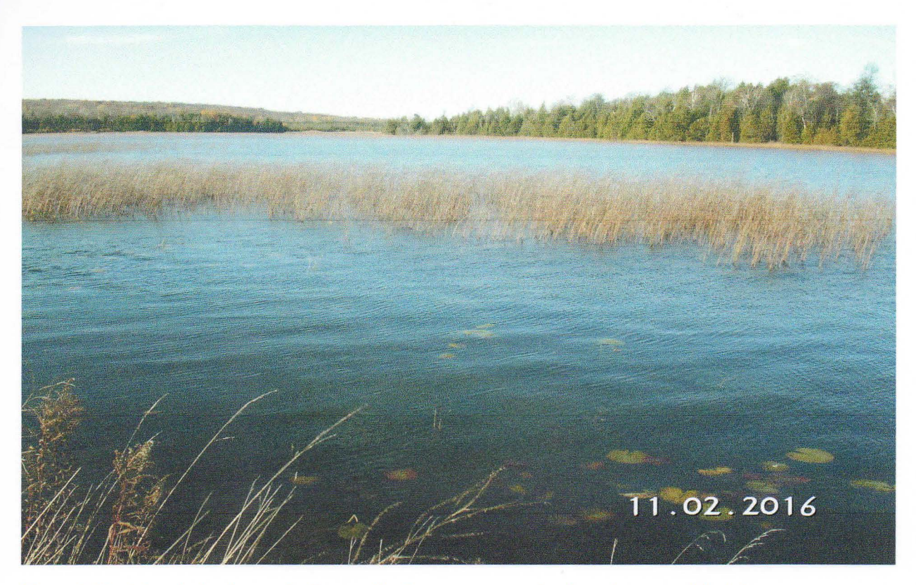
Figure 1. Hardstem bulrush populastion north of causeway growing in water several feet deep.