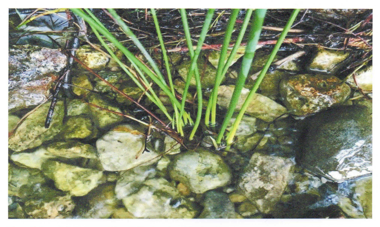
Figure 5. Round stems on seedling, 2016, along Leach's shoreline.