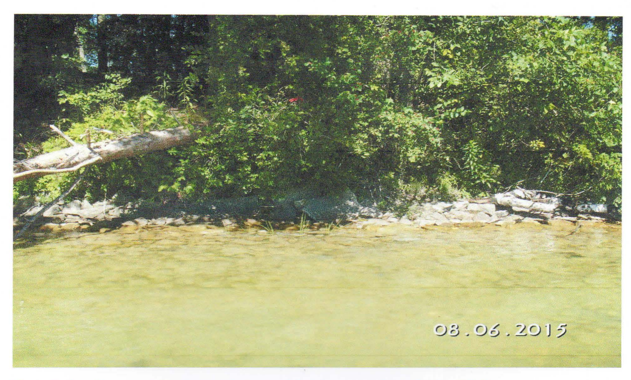
Figure 7. Seedlings on stony shore adjacent to fishstick among shore shrubs at Hoffman.