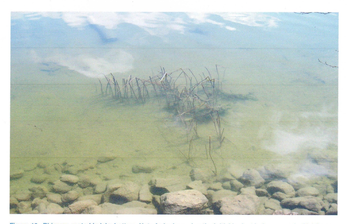
Figure 10. Rhizome rooted in lake bottom. Note forked growing tip. Initial inplant in foreground . Mahlberg.