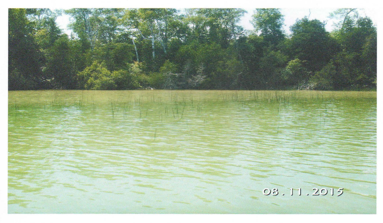
Figure 2. Buirush population at south end of lake. Many stems have been decapitated.