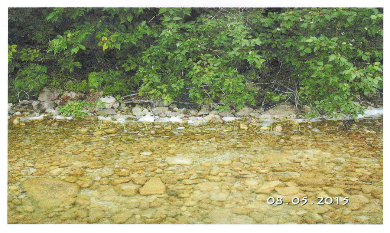
Figure 4. Seedlings in stony shore under native deciduous trees. Second-year growth at Ehlers.