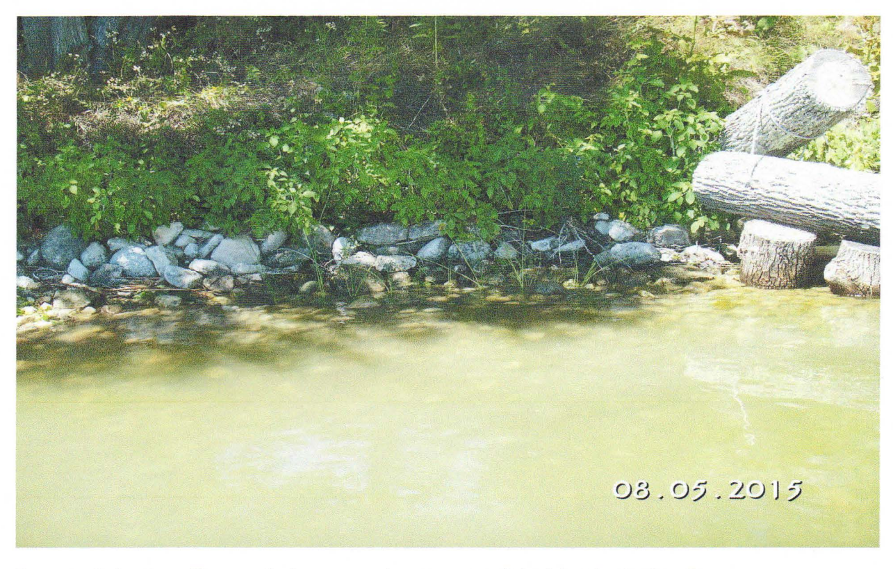
Figure 8. Robust seedlings packed among rocks adjacent to fishstick at Ikeda shoreline