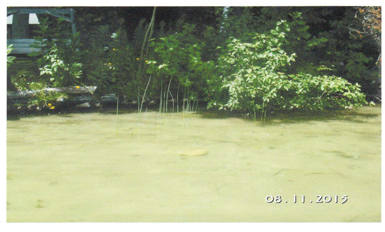
Figure 6. Robust seedlings with tall stems at Schneider shoreline.