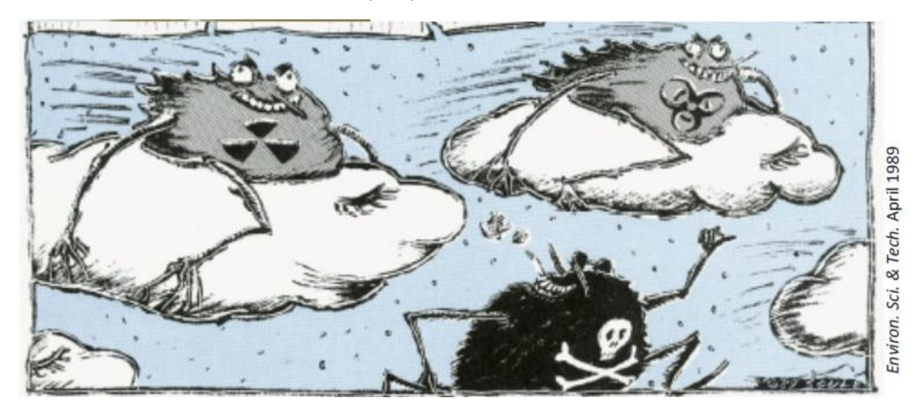
Figure 1. Cartoon of pollutants "hitching a ride" on the grains of sediment during runoff events. Adapted from the Journal of Environmental Science and Technology , April 1989.

The Gracyk et al. study discussed above looked at runoff and nutrients from small catchments of a uniform cover type, "lawn" or "woods." In reality, shoreline properties are an assortment of cover types, including various impervious surfaces, lawns, wooded areas, random trees, mulch, sparse vegetation, cultivars, etc. It is also important to remember that there can be a cocktail of pollutants in runoff; even though this article is primarily discussing phosphorus, other contaminants to consider are house hold cleaners, chemicals and solvents, pesticides, herbicides, and vehicle fluids. Shoreline vegetation can keep those pollutants out of the lake by intercepting the flow of runoff. This is why many shoreline buffers are often referred to as "filter strips." The molecules of phosphorus and many pollutants bind to sediment grains and get carried to water bodies in runoff water (Figure 1). Additionally, sediment carried in runoff will eventually muck up the lake bottom and bury the original substrate of sand, gravel, and rocks that many fish need to spawn. Aquatic insects and mussels are an important part of lake ecology and will also suffer from sedimentation of the lake bottom. Plus, who wants to wade out on a lake bottom of squishy muck?