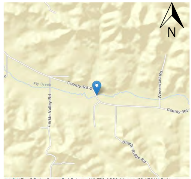
Leaflet | Tiles © Esri — Source: Esri, DeLorme, NAVTEQ, USGS, Intermap, iPC, NRCAN, Esri Japan, METI, Esri China (Hong Kong), Esri (Thailand), TomTom, 2012