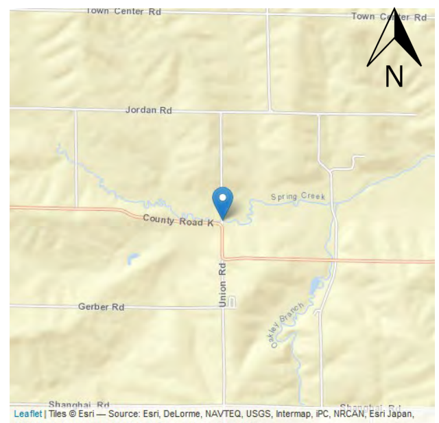
METI, Esri China (Hong Kong), Esri (Thailand), TomTom, 2012