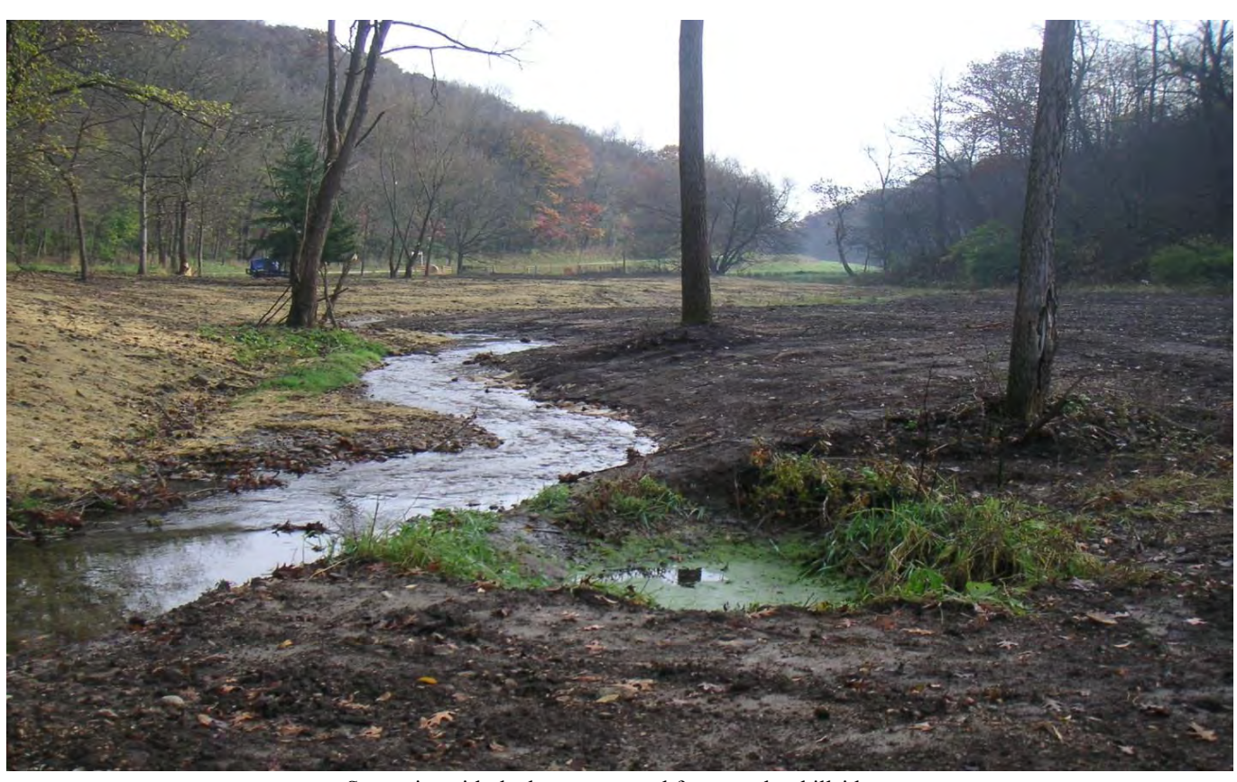
Same site with the berm removed from road to hillside.