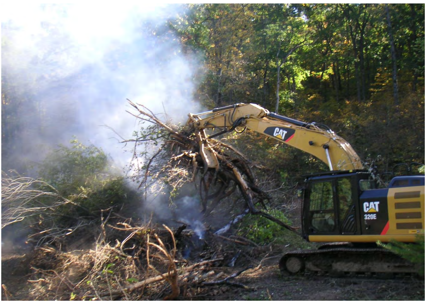
Most of the brush that was removed on the lower section was burned because of the narrow stream corridor. On the upper end where the corridor was wider we placed several large brush piles along the hillside to create habitat for woodland and edge fauna.