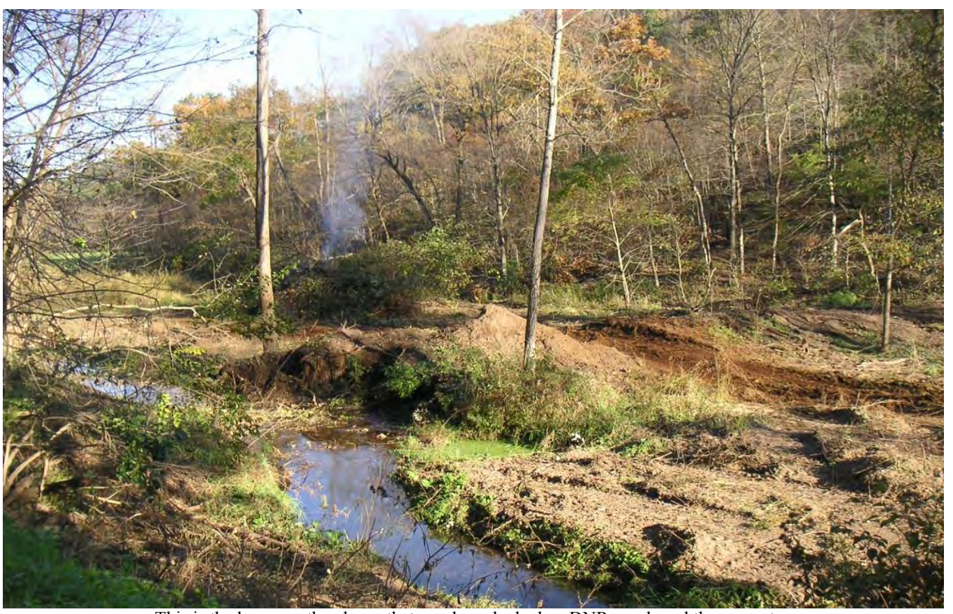
This is the lower earthen berm that was breached when DNR purchased the property.