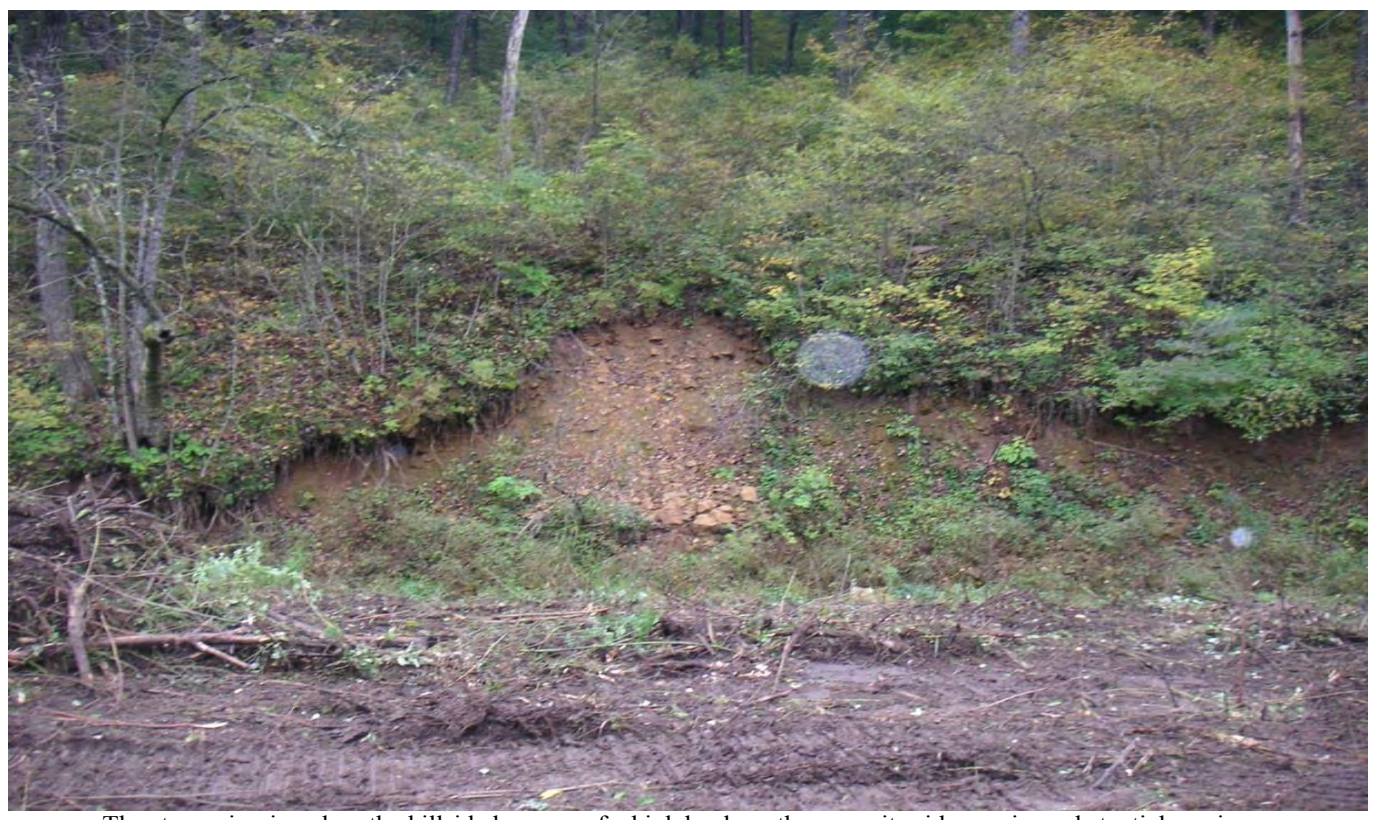
The stream impinged on the hillside because of a high bank on the opposite side causing substantial erosion. Tapering this high bank should slow stream velocity during a high water event, easing erosion on the hill.