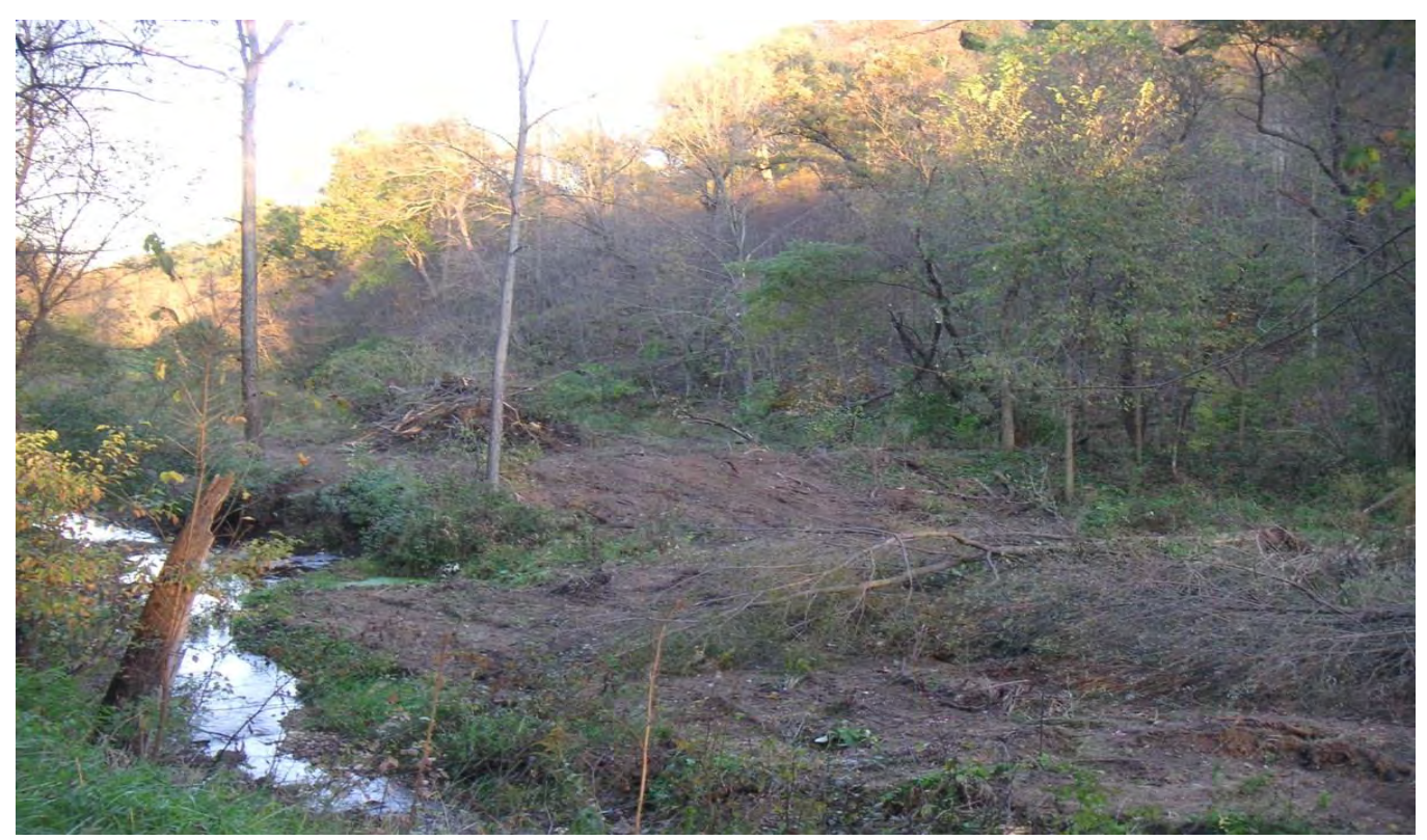
This is the lower berm. It was breeched where you see the stream, after it was purchased by the DNR.