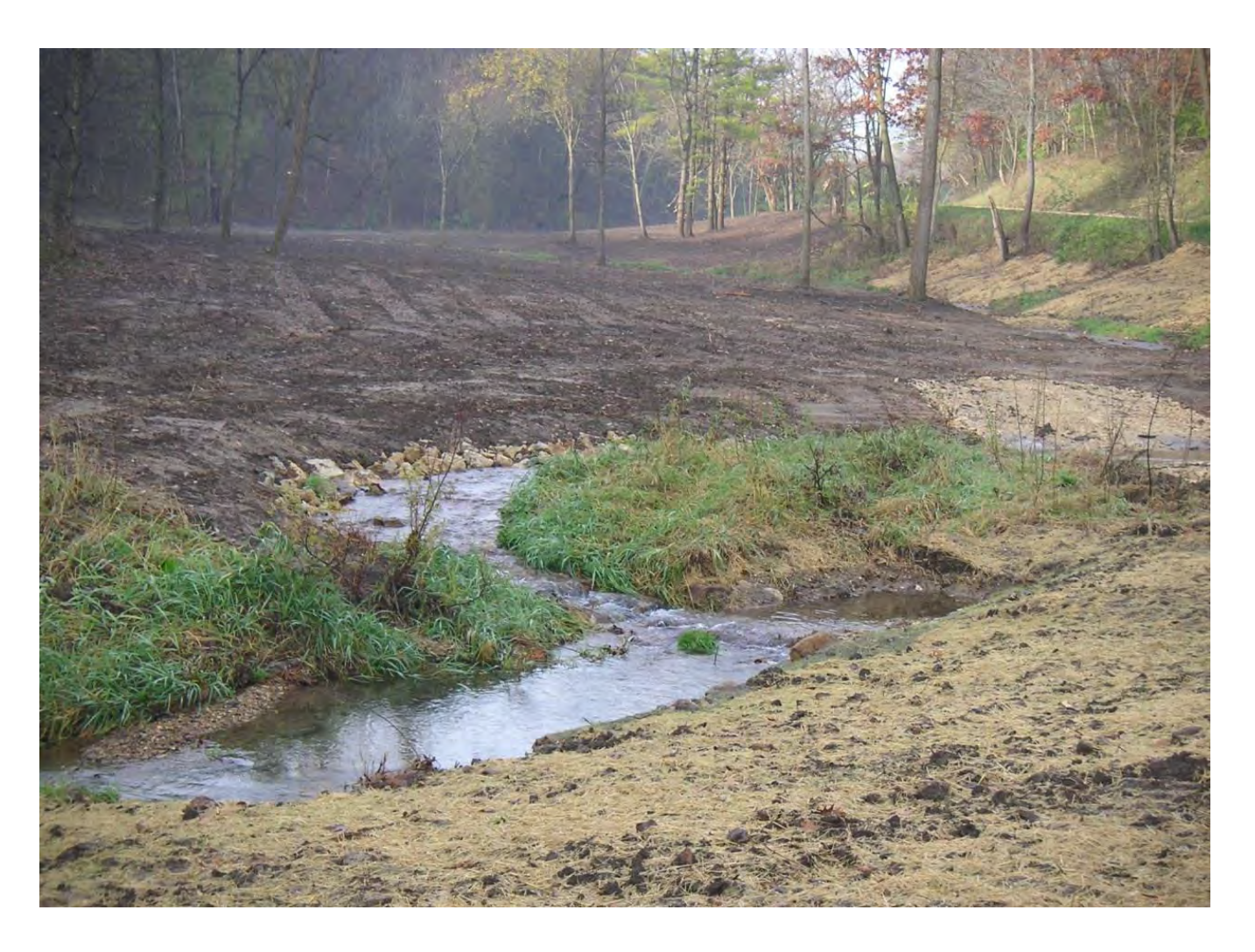
A small back water area created below a small crossing (one of three that were installed) that will allow mower access to help maintain the site in the future.

Wisconsin Department of Natural Resources TU National Embrace-a-Stream Elliot Donnelley Chapter TU Friends of Wis. Trout Madison Fishing Expo Badger Fly Fishers Southern WI Chapter TU Lee Wulff Chapter TU Black Hawk Chapter TU Dave Roh Excavating