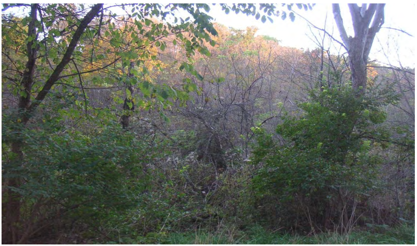
Lower end of site looking upstream from the road. The entire site was overgrown with invasive vegetation, boxelders and willows.