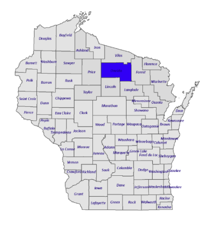
Page 1: May 31, 2020 Aquatic Invasive Species Boat Launch and Shoreline Surveillance Monitoring Report