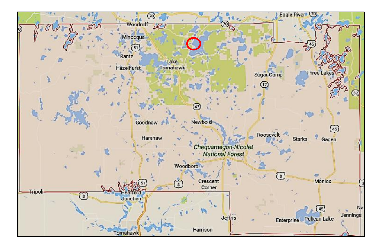
Figure 1. Map of Oneida County, WI with Cunard Lake circled in red (approximate location)

Dissolved Oxygen: These measurements can be seen in Table 2.