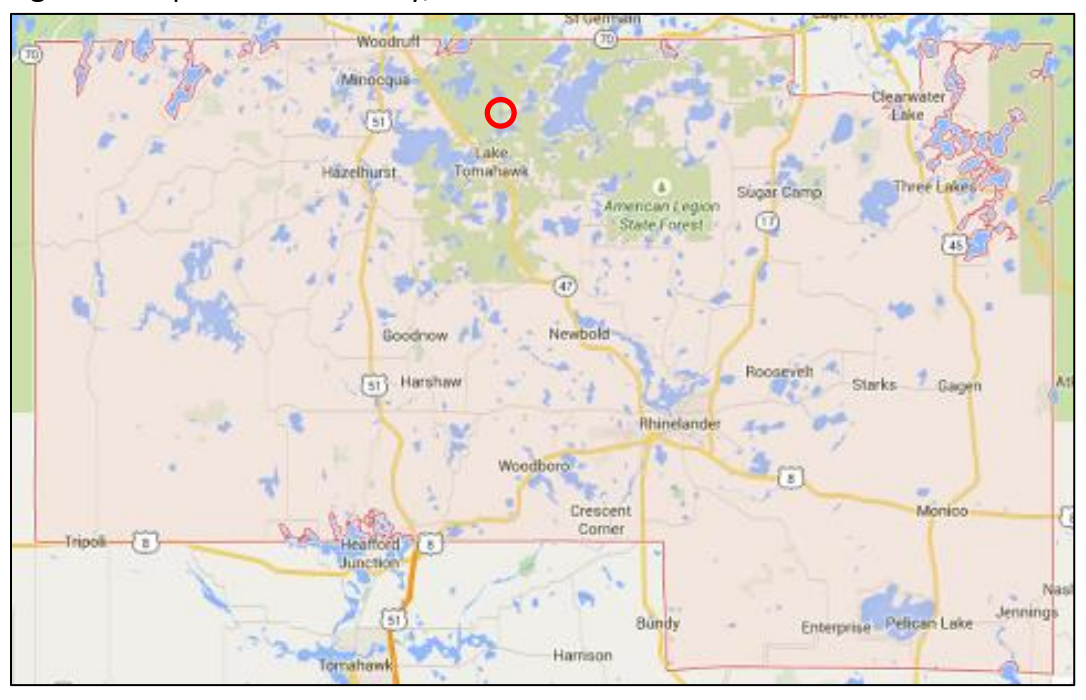
Figure 1. Map of Oneida County, WI with Cunard Lake circled in red.