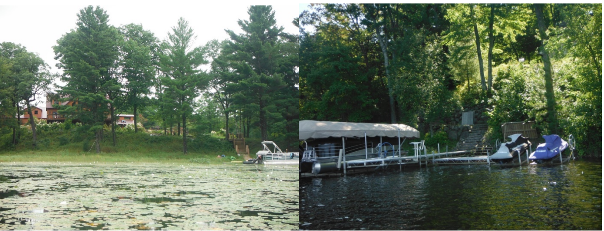
Figure 7: Developed Parcels with a "No Priority" Ranking

The properties shown in Figure 7 have been assessed with the same protocol as the properties surrounding Granite Lake, and have received priority rankings of 'None.' Each property is a little different, but in each parcel, the majority of the land within the riparian zone is comprised of undisturbed, native vegetation. The parcels that are level have some manicured lawn within that zone, but this is treated more like a well-maintained trail. For parcels with a steep slope, having a trail or stairway down to the lake while leaving the rest of the area as native vegetation works best. Not only is this the most lake-friendly approach, but the maintenance and general upkeep of this area becomes much safer, easier, and cost effective.