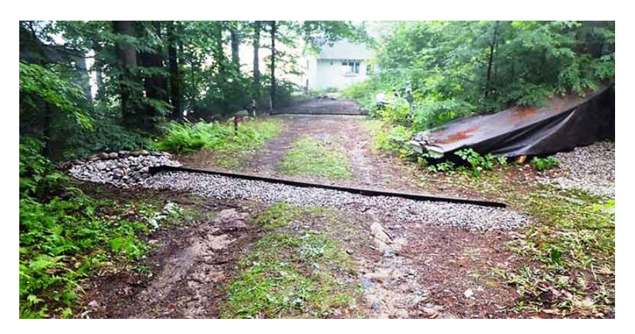
Figure 5: Completed Diversion

of these range anywhere from $25 to $3,750, but the average diversion costs $200. These are very low maintenance, and only require some debris removal that could get stuck in the diversion and occasionally ensuring everything is still secure and in place. This practice does not work well for the purposes of this particular survey, but it is mentioned here as a nod to projects that could be completed further inland than this survey was meant to assess.