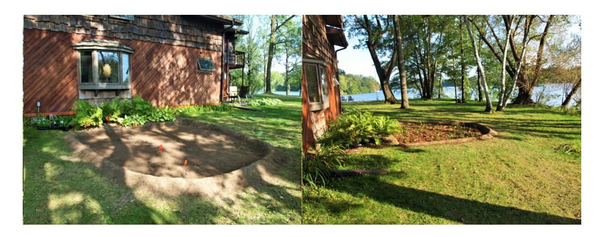
Figure 3: Rain Garden Installation (Left) and Upon Completion (Right)

Native plantings (Figure 4) are intended to establish a buffer zone between the developed portion of a parcel and the lake. The buffer helps filter and slow rainwater runoff so much of it filters into the ground. This buffer zone is created by changing a strip of turf grass, at least ten feet wide, along the shoreline to a natural area composed of native shoreline plants. Similar to rain gardens, these are fairly low maintenance requiring water only until the plants have become established. The only ongoing maintenance is the removal of any invasive species that find their way into the planting. On average, native plantings cost around $1000. This project will work for almost any developed parcel that does not have a sand beach as the primary frontage.