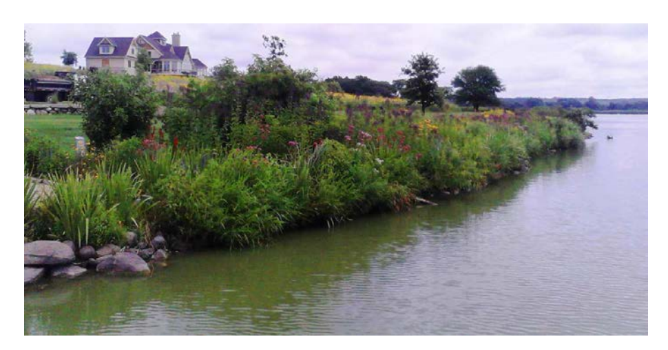
Figure 4: Completed Native Planting

Native plantings (Figure 4) are intended to establish a buffer zone between the developed portion of a parcel and the lake. The buffer helps filter and slow rainwater runoff so much of it filters into the ground. This buffer zone is created by changing a strip of turf grass, at least ten feet wide, along the shoreline to a natural area composed of native shoreline plants. Similar to rain gardens, these are fairly low maintenance requiring water only until the plants have become established. The only ongoing maintenance is the removal of any invasive species that find their way into the planting. On average, native plantings cost around $1000. This project will work for almost any developed parcel that does not have a sand beach as the primary frontage.