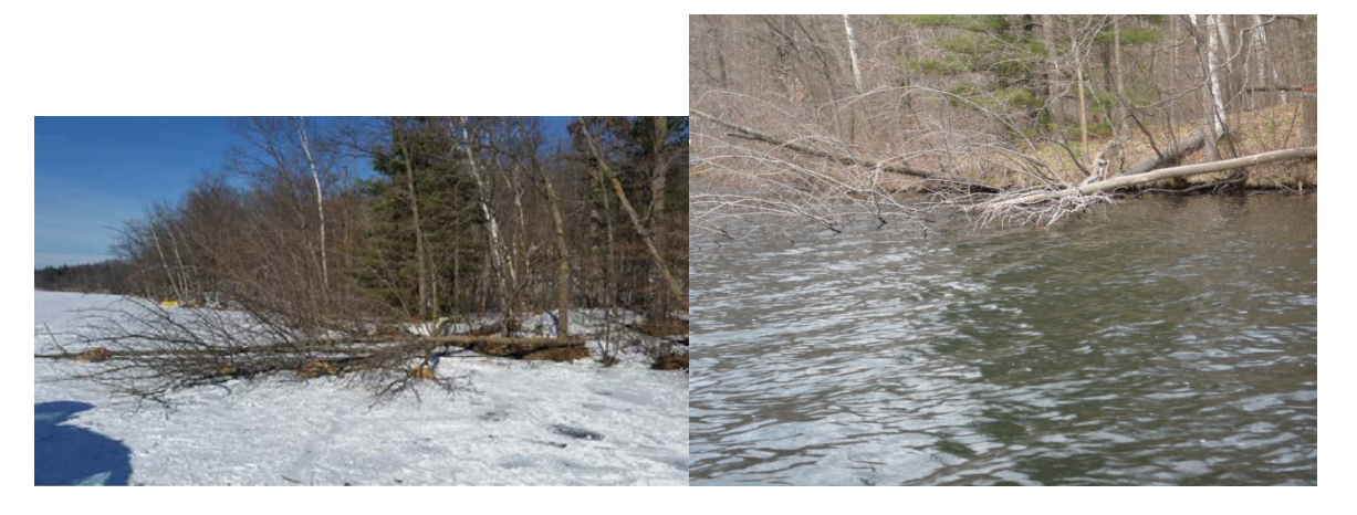
Figure 2: Fishsticks installation (left) and after ice out (right).

Fish sticks (Figure 2) is taking trees from inland, and installing them in the lake to mimic shore trees that will eventually fall into the lake. The trees used must be taken from a minimum of 35 feet inland and are then secured to the shore with cables for approximately 3 years. This provides habitat for fish, birds, and many other animals. In addition to providing habitat, fish sticks help protect the shoreline from bank erosion. Fish sticks project costs range anywhere from $100 to $1000, averaging about $500. These are very low maintenance because it is only necessary to occasionally check the cables to ensure they are secure. This practice would work well for almost any of the developed parcels on the flowage.