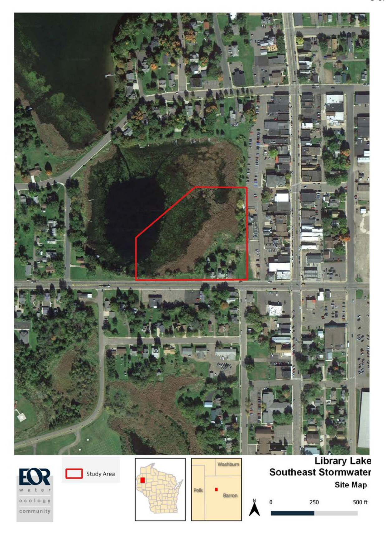
Figure 1. Study Area boundary