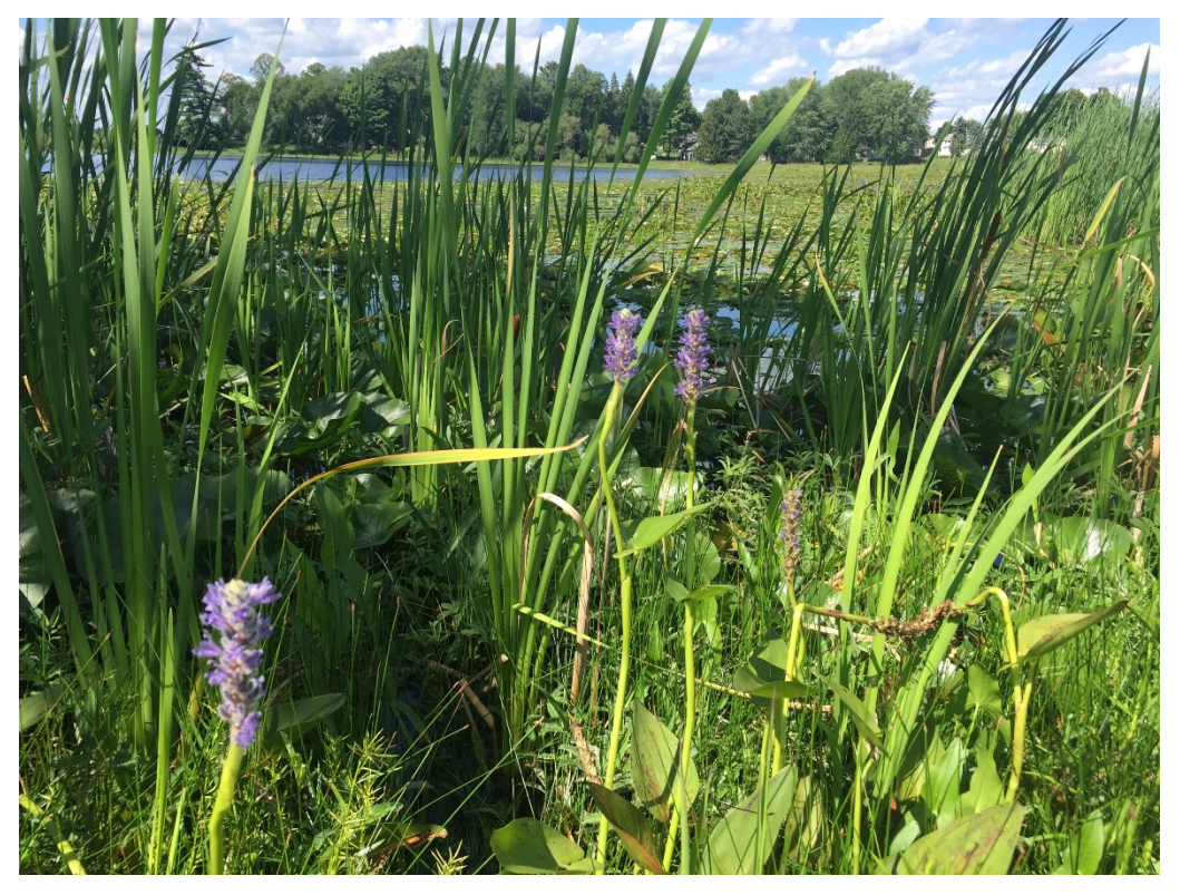
Photograph 6. Good-quality shallow marsh in southwestern portion of Study Area dominated by broad-leaf cattail, pickerelweed, three way sedge, and common spikerush.