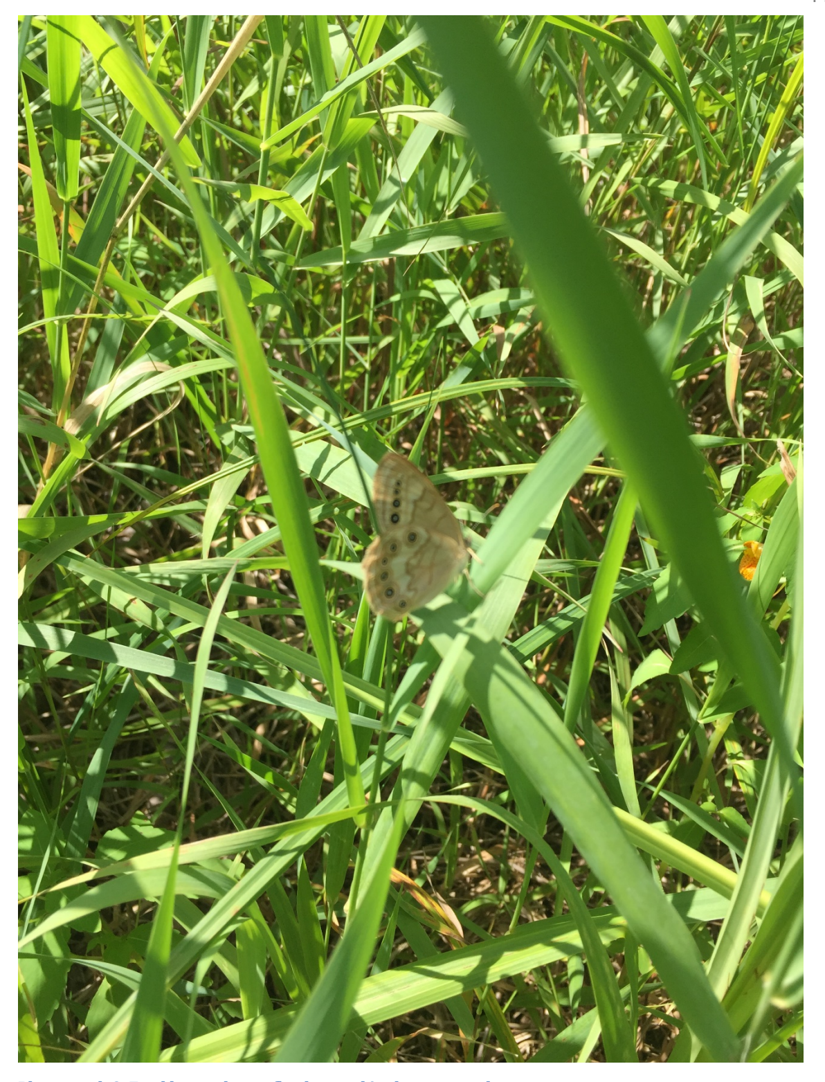
Photograph 9. Eyed brown butterfly observed in the wet meadow.