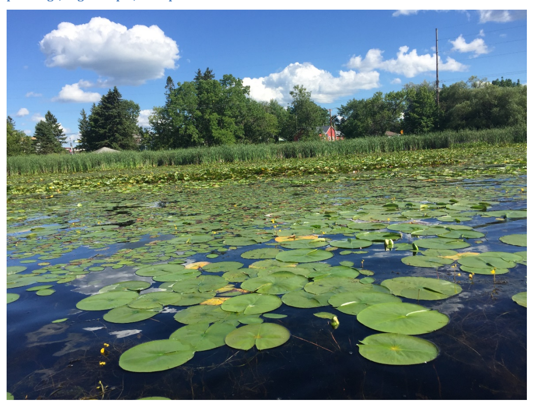
Photograph 8. High-quality aquatic plant community; floating-leaved plants white water lily and watershield are visible in foreground along with yellow flowers of common bladderwort.