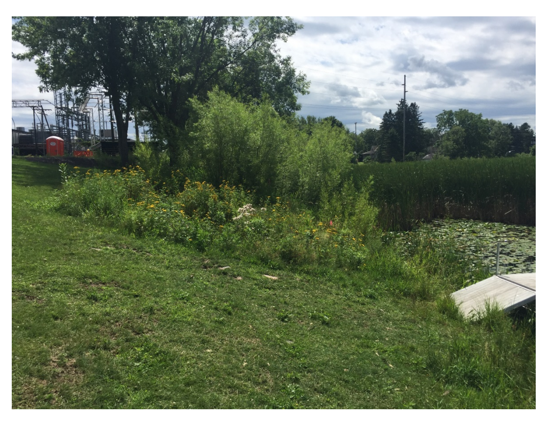
Photograph 3. From northern extent of the Study Area looking at transition between disturbed woodland, shrub-carr dominated by sandbar willow, and shallow marsh dominated by cattail.