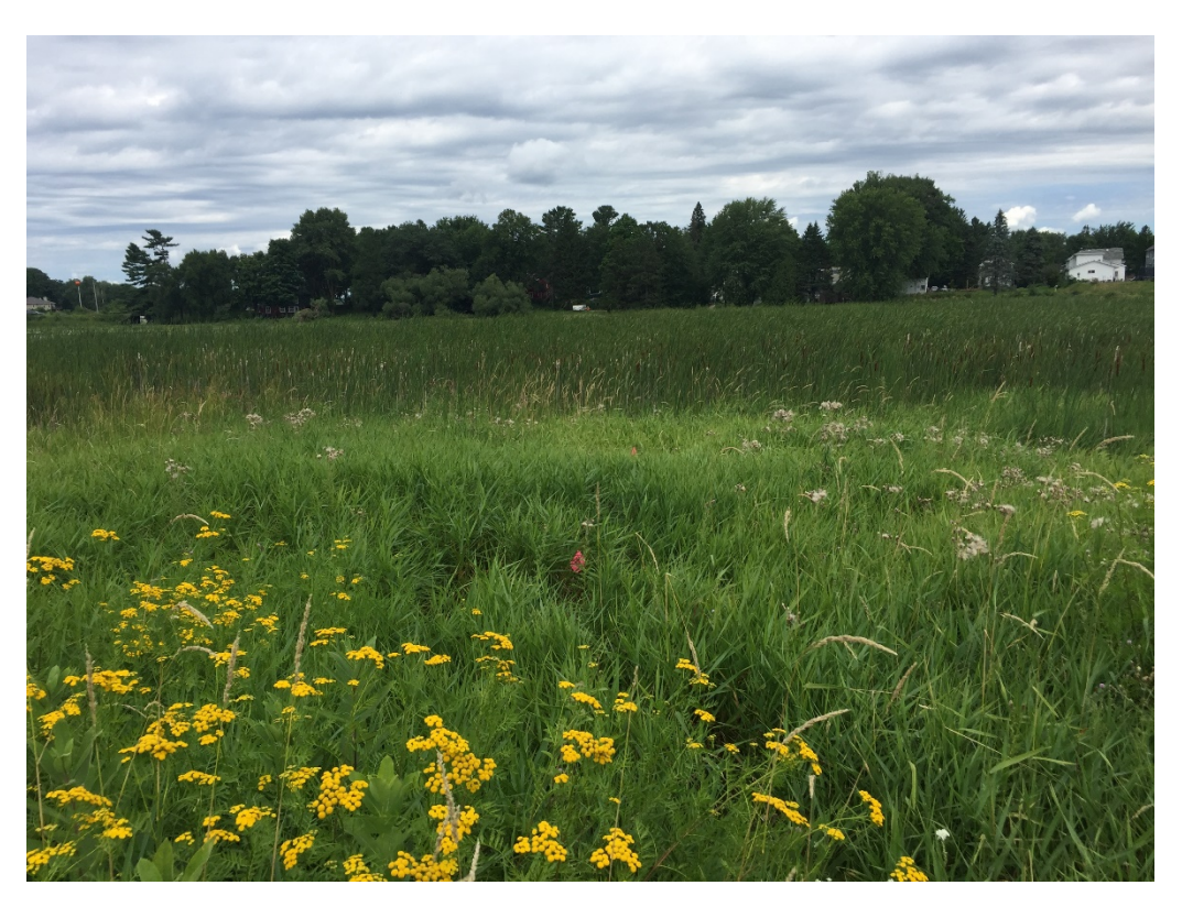
Photograph 1. Looking toward reed canary grass-dominated wet meadow and cattail-dominated shallow marsh from the edge of unmanaged, weed-dominated grassland.