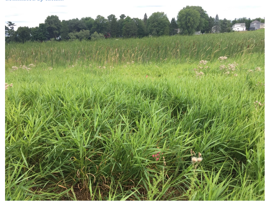
Photograph 4. Wet meadow dominated by reed canary grass looking toward shallow marsh dominated by cattail.