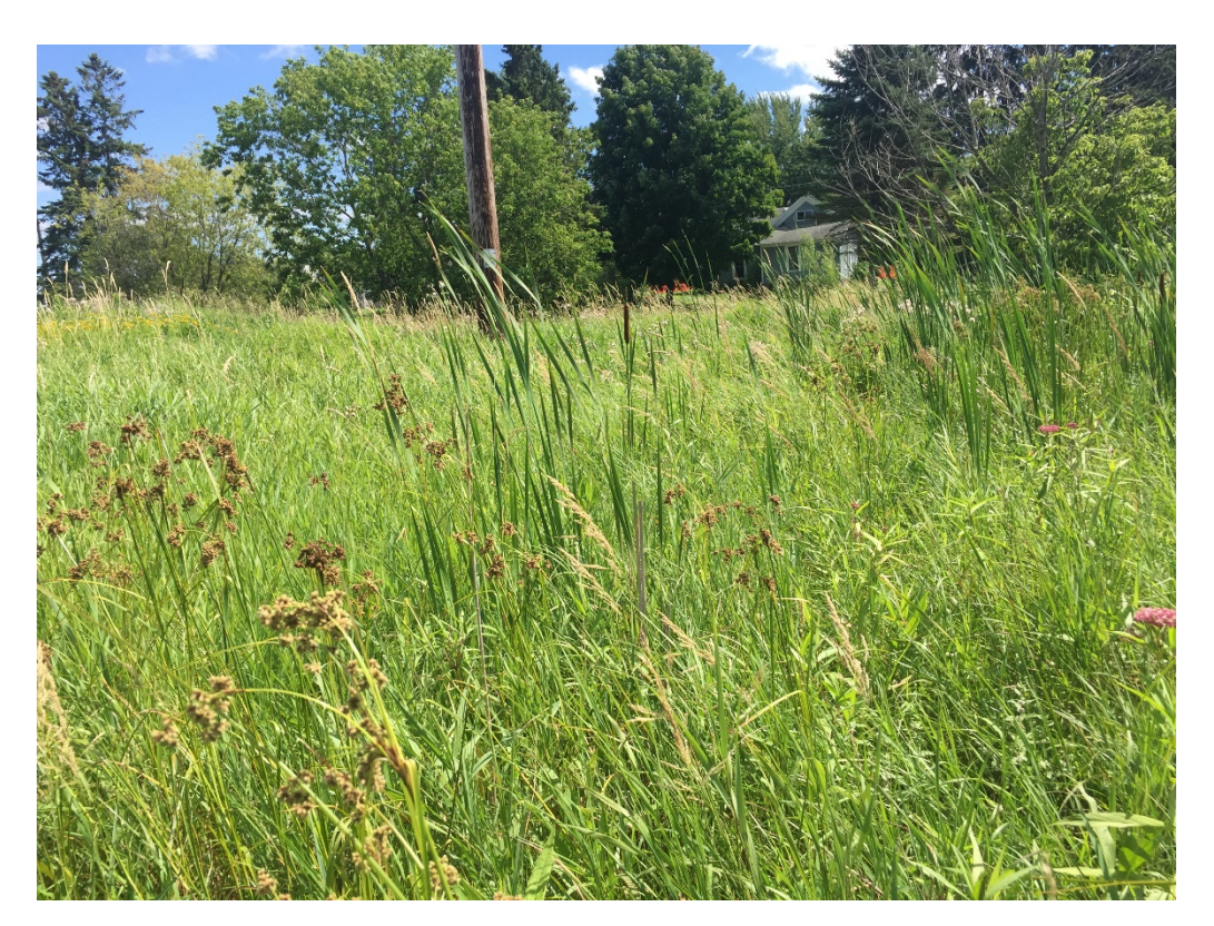
Photograph 5. Area of wet meadow with some diversity of native species including bluejoint, dark green bulrush, and marsh milkweed. Reed canary grass is still dominant.