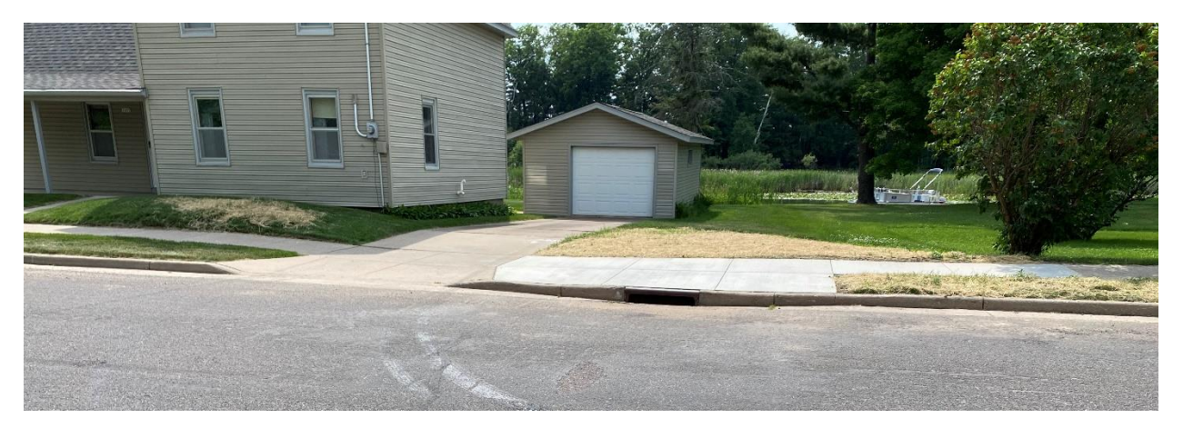
Photo 3. Completed site restoration at 3<sup>rd</sup> Avenue, including seeding and concrete sidewalk