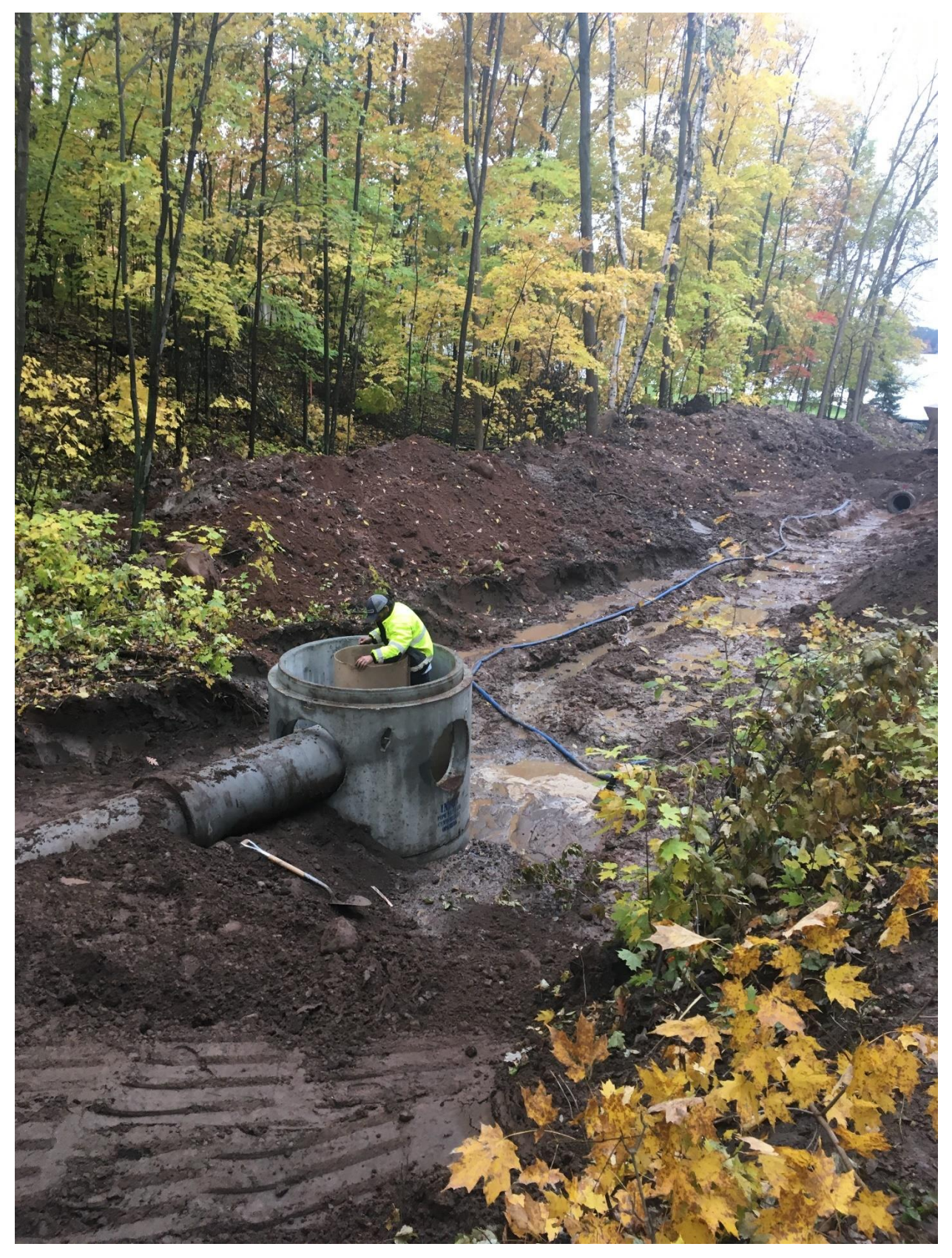
Photo 9. Installing hydrodynamic separator unit at Goldsmith site on Jeffery Boulevard