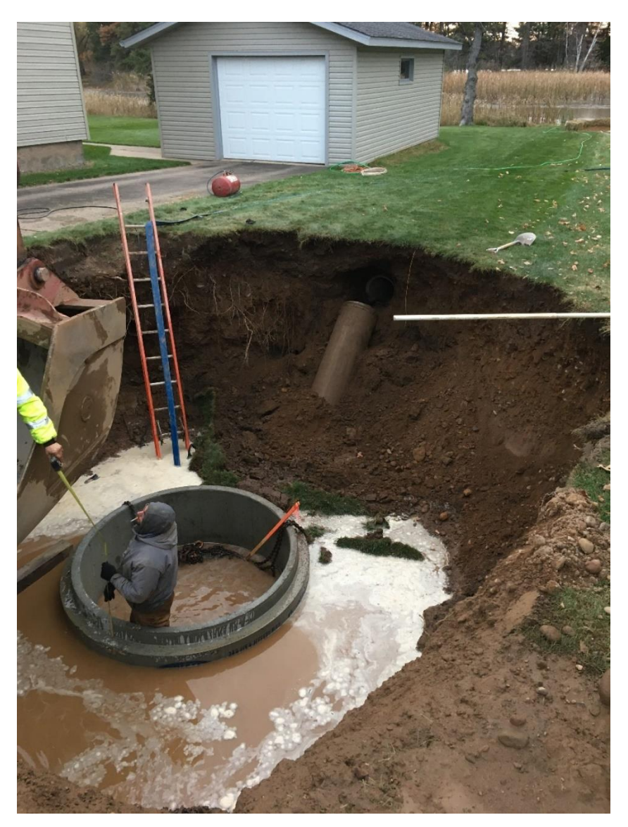
Photo 2. Installing hydrodynamic separator manhole at 3<sup>rd</sup> Avenue