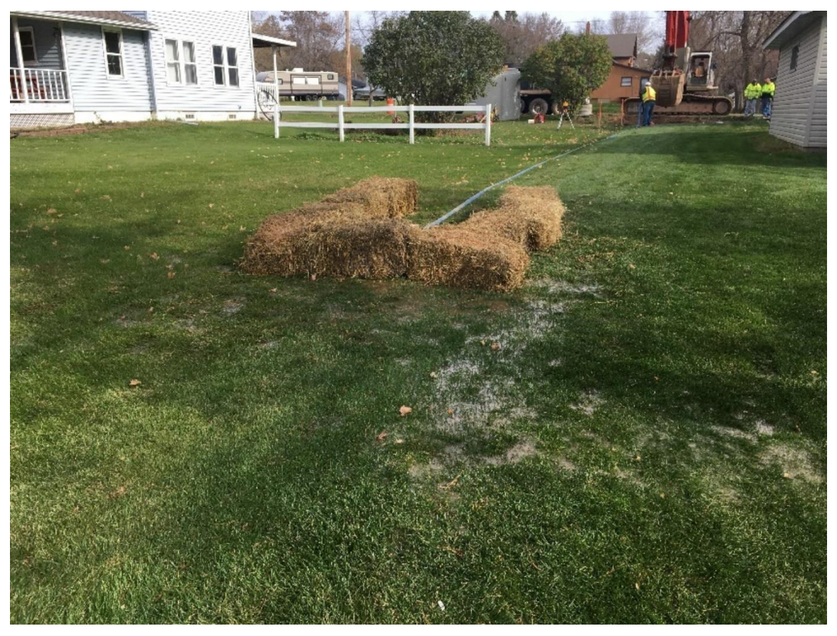
Photo 1. Dewatering at 3<sup>rd</sup> Avenue project site during excavation

See below for images of each project site during and after construction.