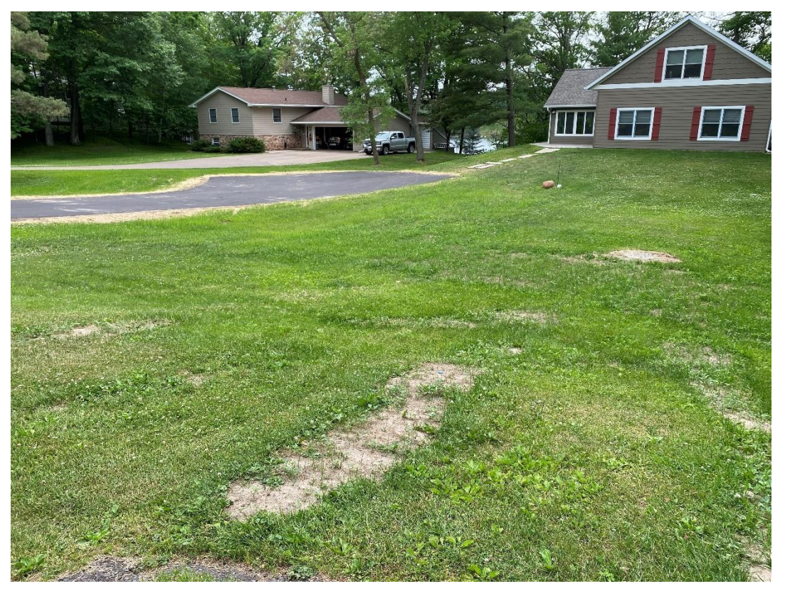
Photo 8. The restored site at Cifaldi residence, along Jeffery Boulevard

Photo 7. Installing hydrodynamic separator unit