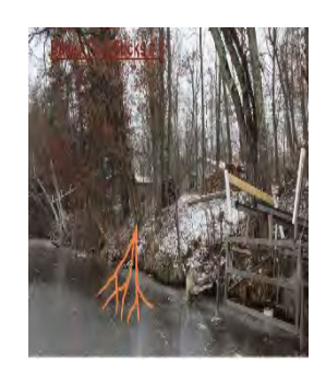
Photo 1: October 25, 2018 initial planning visit fish stick placement

Photo 2: DNR approval for placement of fish sticks January 28, 2019