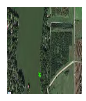
Photo 1: October 2, 2018 initial planning visit fish stick placement

Photo 2: DNR approval for placement of fish sticks November 5, 2018