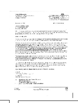
Photo 2: DNR approval for placement of fish sticks November 2, 2018