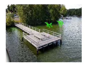
Photo 1: October 1 1, 2018 initial planning visit fish stick placement

Photo 2: DNR approval for placement of fish sticks November 29, 2018