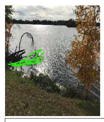
Photo 1: October 12, 2018 initial planning visit fish stick placement