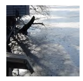
Photo 1: November 14, 2018 initial planning visit fish stick placement

Photo 2: DNR approval for placement of fish sticks November 19, 2018