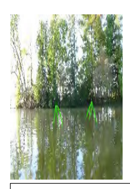
Photo 1: September 26, 2018 initial planning visit fish stick placement