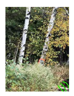
Photo 1: October 17, 2018 initial planning visit fish stick placement