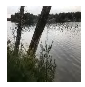
Photo 1: November 8, 2018 initial planning visit fish stick placement

Photo 2: DNR approval for placement of fish sticks November 12, 2018