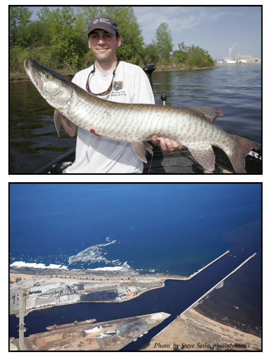
Aerial view of the mouth of the Menominee River