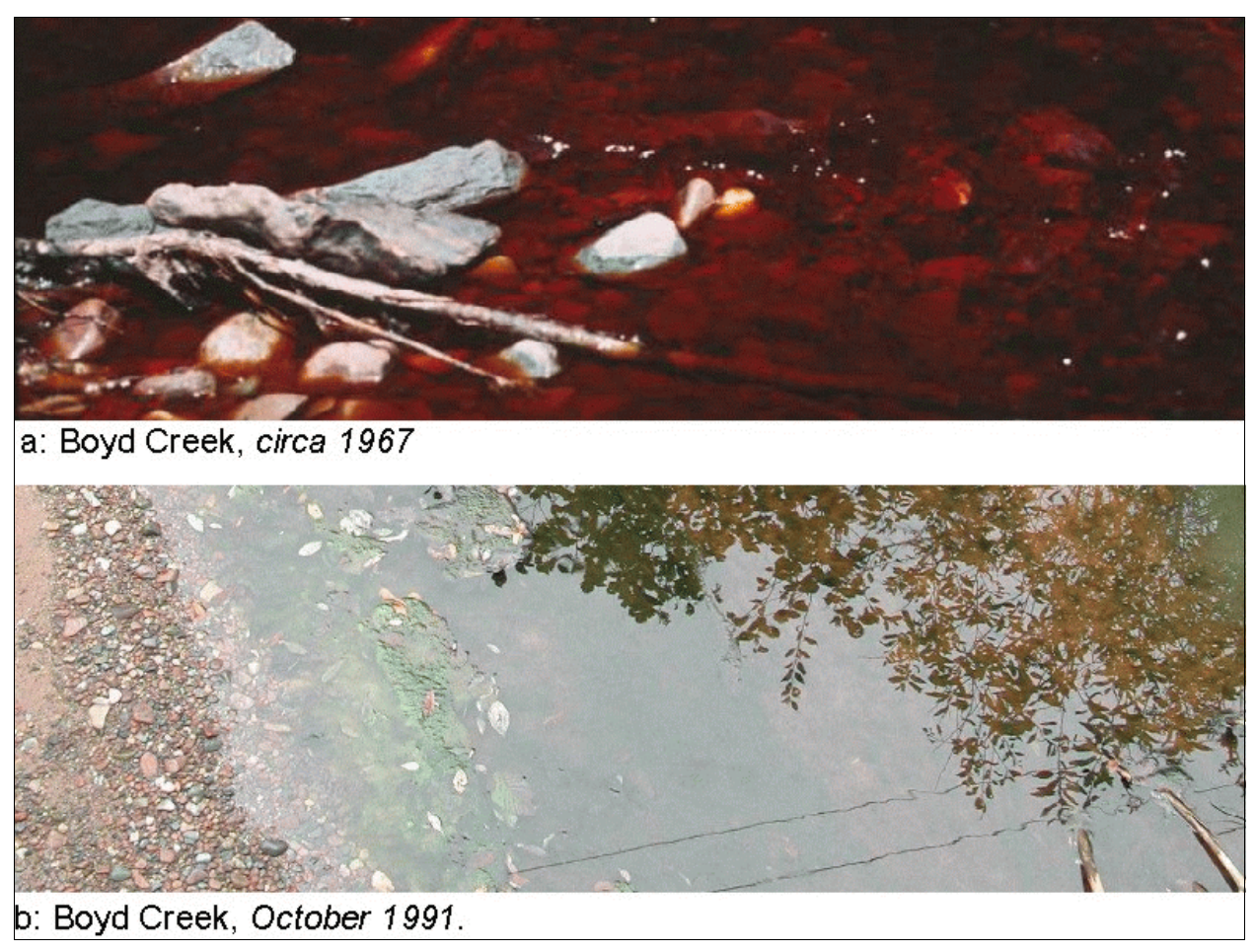
Figure 2: Photographic Comparison of Past and Current Boyd Creek.

samples were collected from 11 locations on Boyd Creek, and one sample was collected from an intermittent creek on the former DuPont Barksdale property that later enters Boyd Creek near Chequamegon Bay. Two Boyd Creek sediment sample locations from upper portions of the former DuPont Barksdale property had TNT at 12.0 and 1.4 milligrams per kilogram (mg/kg) and 2,4-DNT at 0.29 and 0.47 mg/kg, with 2,6-DNT at 0.27 and 0.2 mg/kg. Evidence of TNT and DNT traces were also found in sediment samples from two other Boyd Creek locations. The sediment sample from the intermittent creek had 2,4-DNT at 0.45 mg/kg, and traces of TNT and 2,6-DNT. Surface water samples were collected from three locations on Boyd Creek. While TNT and 2,4-DNT were not detected in any water samples, 2,6-DNT was found in every water sample, ranging from 0.016 to 1.1 micrograms per liter (μg/L).