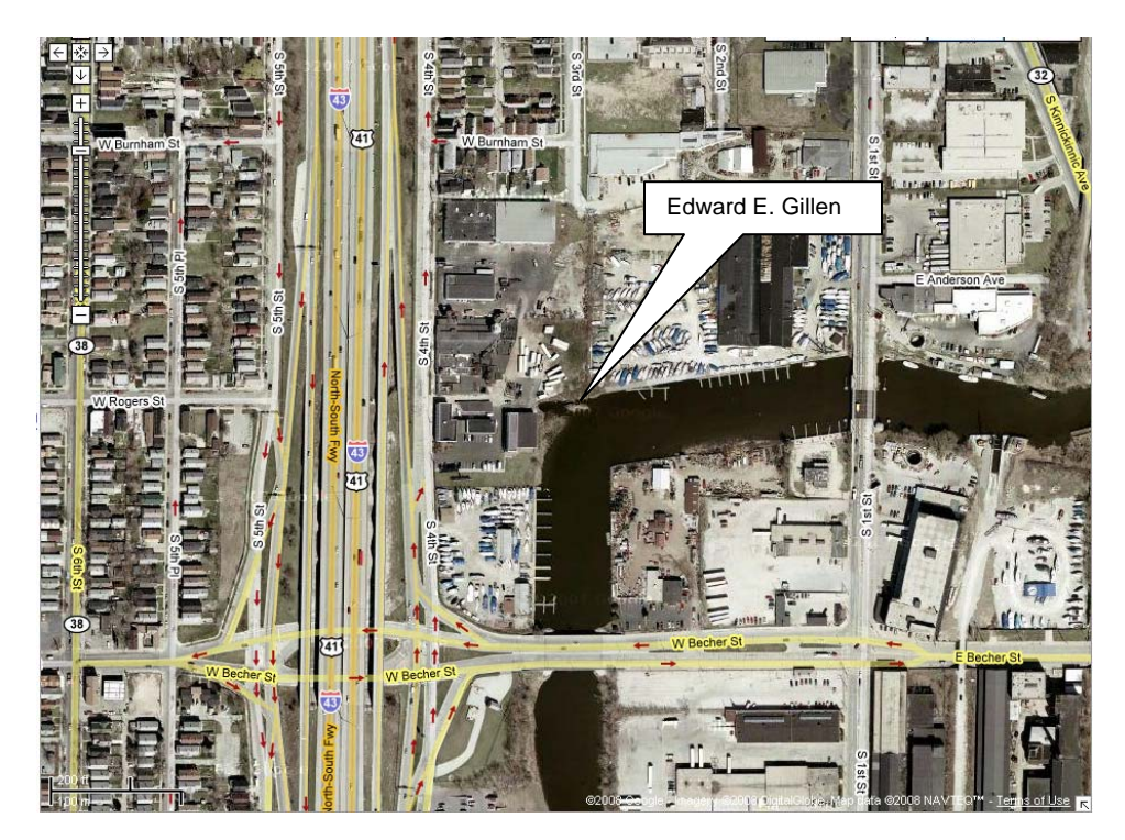
FIGURE 3. Location of the wreck of the tugboat Edward E. Gillen at a bend in the Kinnickinnic River within the City of Milwaukee (Google).