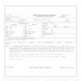
EdwEGillen (227538) data sheet.tif