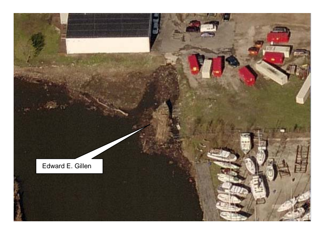
FIGURE 4. Aerial photo (close-up, from east) showing the wreck of the Edward E. Gillen, Summer 2007; note location below storm sewer outlet.