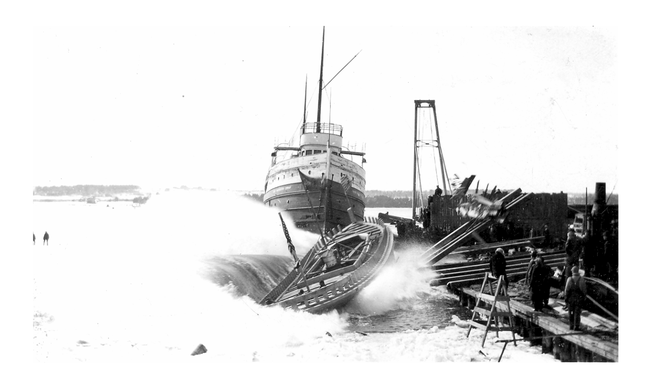
FIGURE 2. Launch of the tugboat Edward E. Gillen at Sturgeon Bay, WI, 1928 (Milwaukee Public Library).