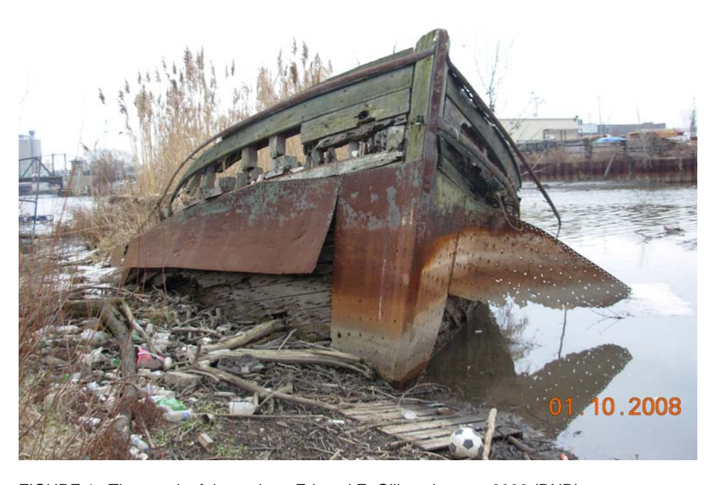
FIGURE 1. The wreck of the tugboat Edward E. Gillen, January 2008.

Following discussions with staff of the WHS about the desirability of obtaining a formal Determination of Eligibility for the wreck, an agreement was made to accept a brief narrative report describing the wreck in lieu of a formal DOE (C. Brown, WHS: personal communication).