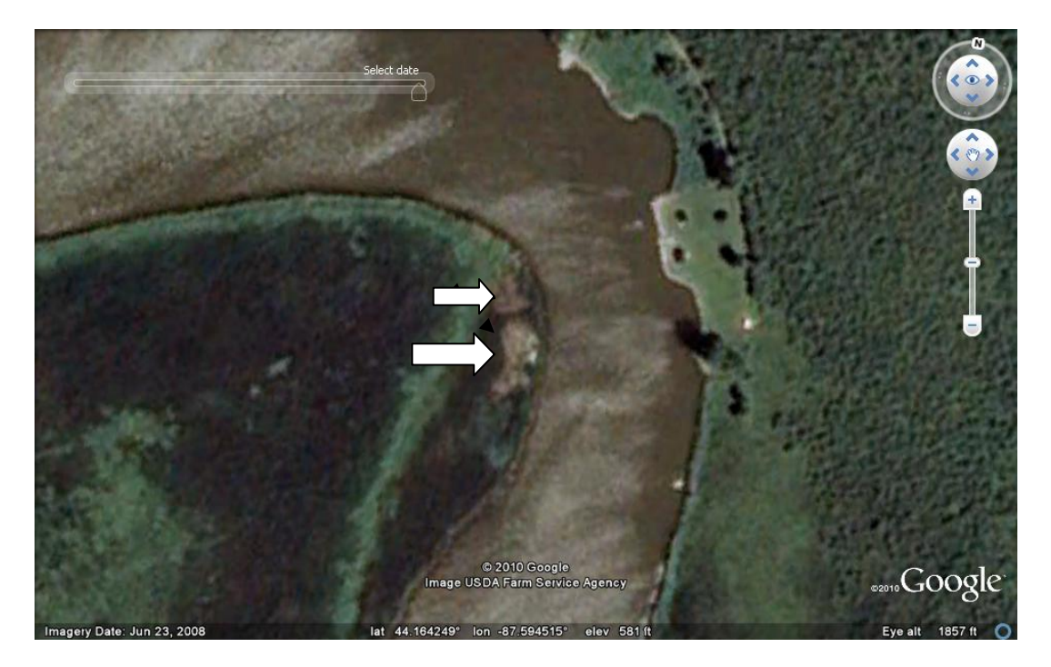
Aerial taken the summer of 2008- areas indicated were treated fall 2007

It appears that the bundle-cut-treat method may have been more effective in our case than foliar spray, but we didn't attempt to carefully study a comparison of the methods so that observation is subjective. For large, dense stands, foliar application was the only practical method at the time.