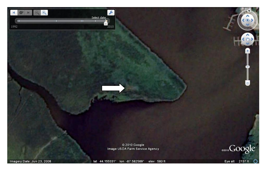
Taken June 2008, area indicated was treated fall 2007