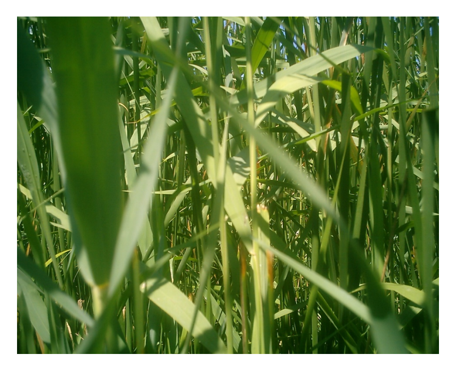
Interior of Phragmites colony at Woodland Dunes

In late 2006 Woodland Dunes purchased a parcel of land comprised of about 30 acres of cattail marsh adjacent to marsh already owned and protected within the preserve. On that property a moderately sized colony of Pragmites australis was noted, and subsequently our staff began to become aware of other, scattered small colonies elsewhere in the marsh along the West Twin River. Additional colonies were noted across the river at various points on property not owned by Woodland Dunes. In 2007 Woodland Dunes applied for and received approval for a Rapid Response AIS (Aquatic Invasive Species) grant from DNR to attempt to control the colonies within the preserve. This report describes our activities over the last four years regarding that project.