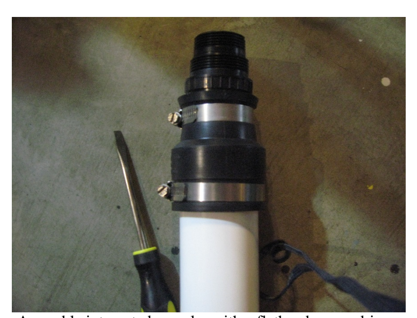
Assemble integrated sampler with a flathead screw driver.