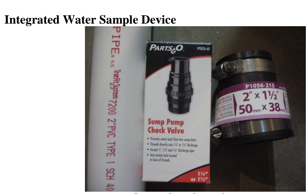
Integrated sampler requirements, 2"Pvc pipe, sump pump check valve, and 2"x 1 1/2"couping