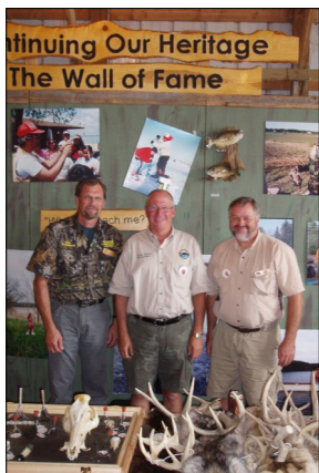
WCC Delegates volunteering their time at the WCC display

We're on the web! Visit dnr.wi.gov and search for “Conservation Congress”