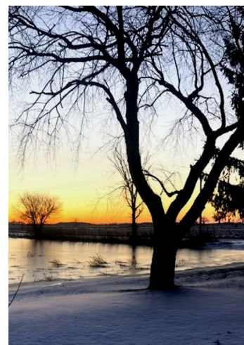
Winter glow.