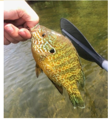
Sam also caught this beautiful pumpkin seed while kayaking on Rockland lake.