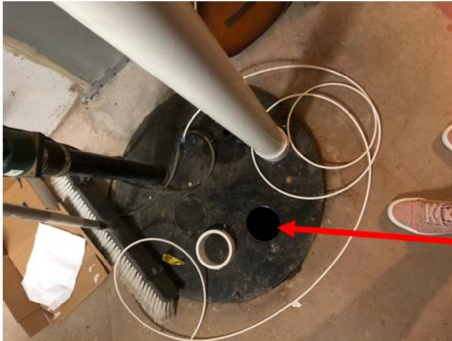
Open hole in the at the base of the northern basement