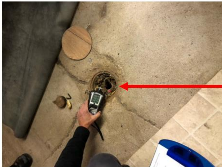
What appears to abandoned mo northern basem to be filled, bu the top with co elevations wer PID.