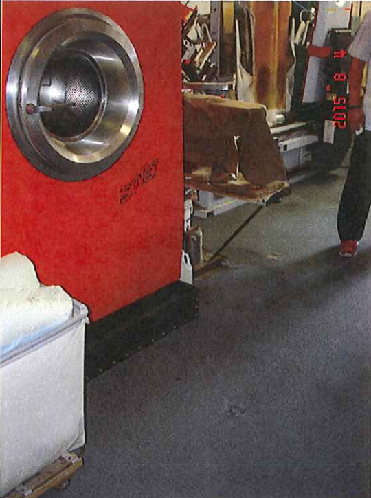
Title: Photo facing southeast towards dry cleaning machine with containment beneath it. Floor in excellent condition, with small sealed holes in the carpeting where boreholes had been drilled.