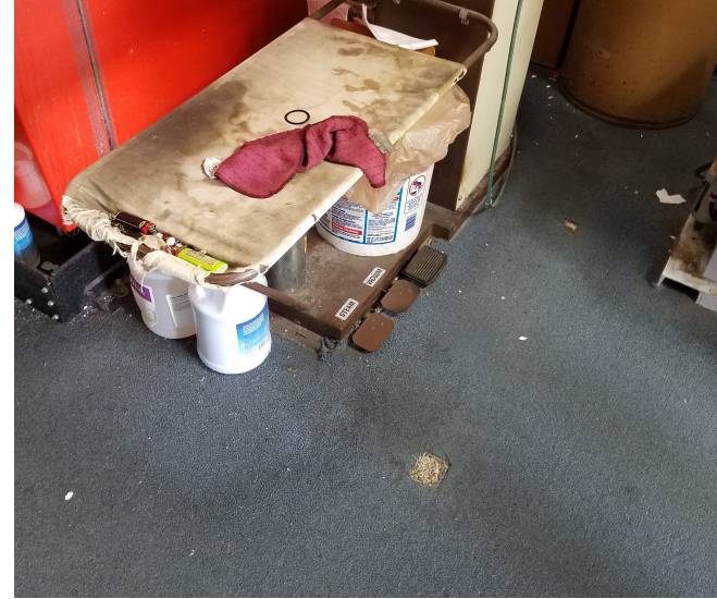
Title: Borehole near dry cleaning equipment