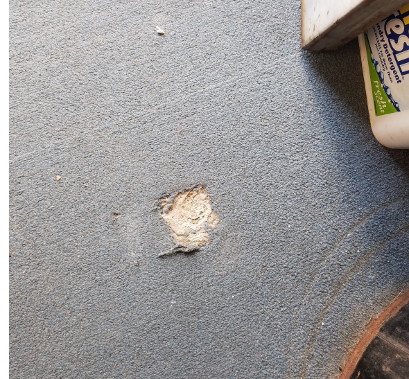
Title: Exposed boring location