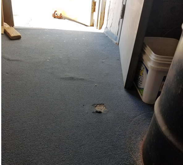
Title: Floor condition near drums in the back of the Site