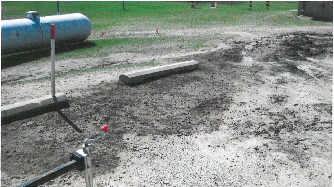
Area of spill